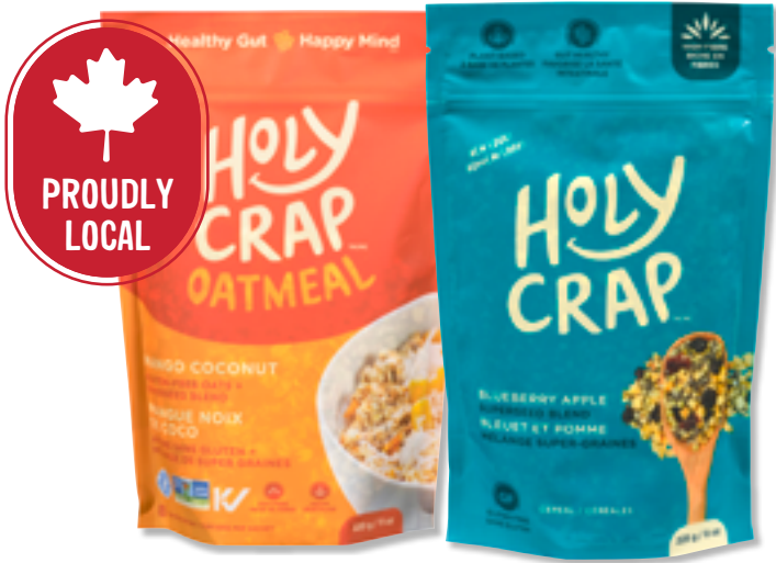
HOLY CRAP ORGANIC CEREAL 225 g or oatmeal 320 g