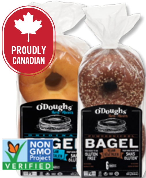
O'DOUGHS BAGEL THINS 6's • vegan gluten-free