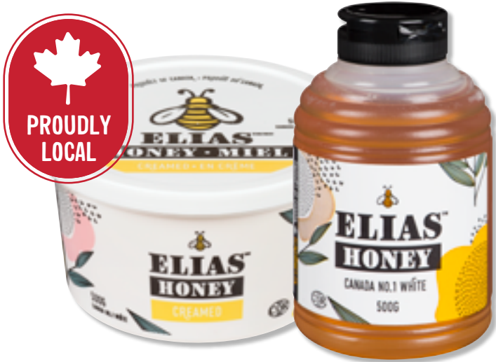
ELIAS HONEY selected 500 g