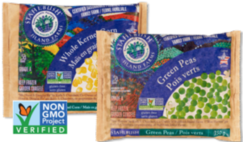
STAHLBUSH ISLAND FARMS FROZEN VEGETABLES 283 g - 397 g