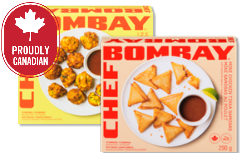
CHEF BOMBAY FROZEN APPETIZERS 240 g - 350 g