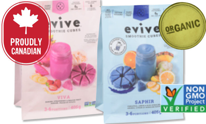
EVIVE ORGANIC BLENDER-FREE SMOOTHIE CUBES 405 g