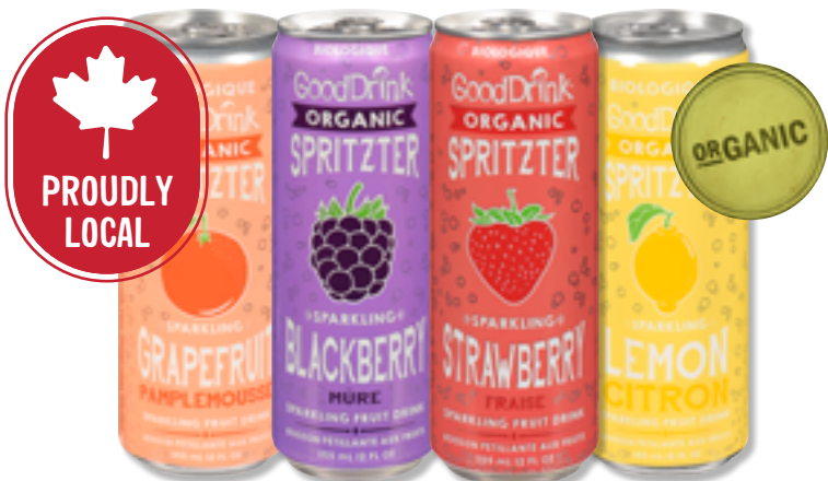
GOODDRINK ORGANIC SPRITZTER ORGANIC SPARKLING FRUIT DRINKS 355 mL plus deposit & recycle fee