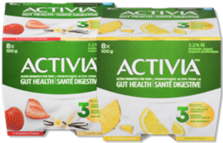
DANONE ACTIVIA ACTIVIA PROBIOTIC YOGURT 8x100 g