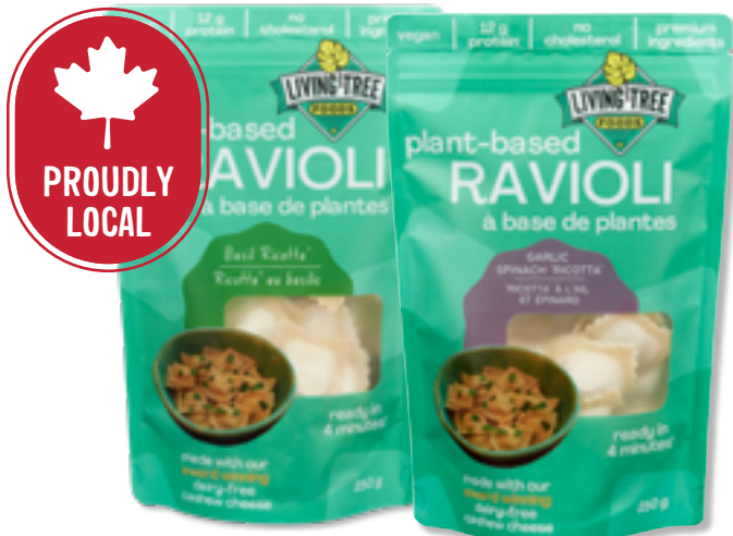
LIVING TREE FOODS PLANT-BASED RAVIOLI 250 g