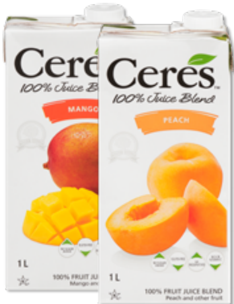
CERES 100% TROPICAL FRUIT JUICE BLEND 1 L plus deposit & recycle fee