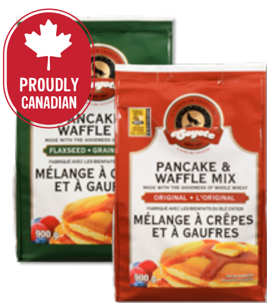
COYOTE PANCAKE & WAFFLE MIX 900 g