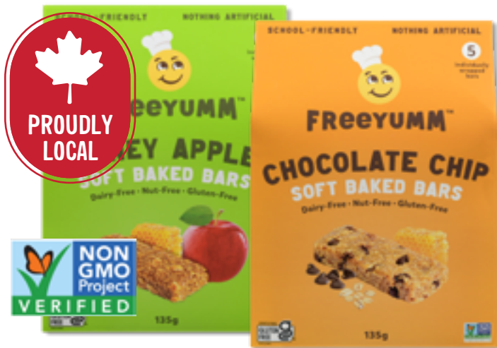
FREEYUM SOFT BAKED GRANOLA BARS 135 g • gluten-free