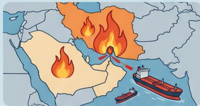
MIDDLE EAST ENERGY SHOCK & CONFLICT (Hormuz Blockade, $126/bbl Oil, US-Iran Tension)