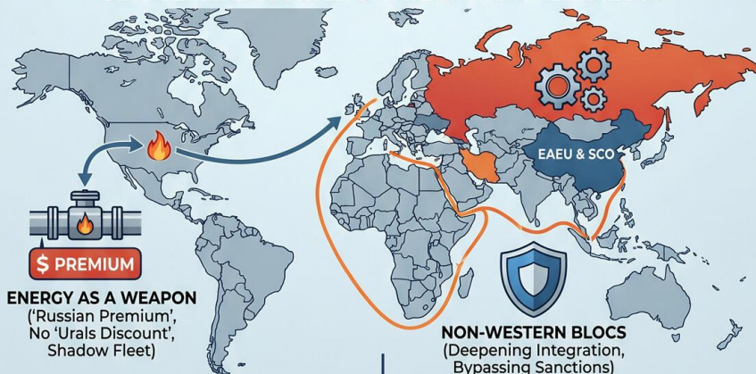
ENERGY AS A WEAPON (Russian Premium, No 'Urals Discount', Shadow Fleet)