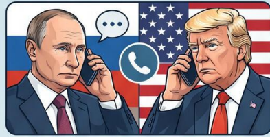
PUTIN-TRUMP 'REALIST' DIPLOMACY (90-min Call, Proposed 'Victory Day' Truce, Bypassing Bureaucracy)