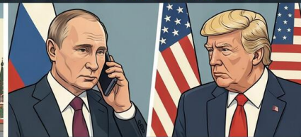
TRUMP-MEDIATED CEASEFIRE: A FRAGILE TRUCE (MAY 9-11)