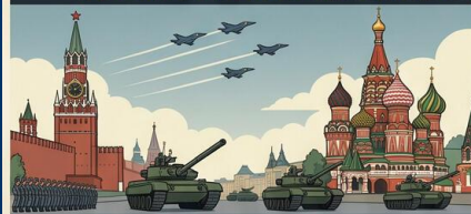
1945-2026: CONTINUING THE STRUGGLE AGAINST FASCISM