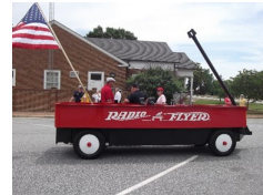
Memorial Day Parade 2014

Strike up the Band! The Jamestown Lions Club and the Jamestown Veterans Committee will host the Jamestown Memorial Day Parade on Sunday May 24th, 2015. The parade time is 3:00 pm and begins in the Town Hall parking lot. If you remember, last year the Lions Club decided to sponsor a Memorial Day Parade instead of a July 4th Parade. The purpose of the Memorial Day Parade is to remember the service, sacrifice and commitment of those who died while serving in the United State Armed Forces. Please participate in this annual parade to honor our military personnel. Last year's parade was very successful. If you would like to have an entry in the parade, we ask that each entry decorate in a patriotic theme. All military vehicles are welcomed. Please make plans to attend. If you would like to have an entry in the parade, please contact the Jamestown Lions Club at nfaircloth@northstate.net for information and applications.