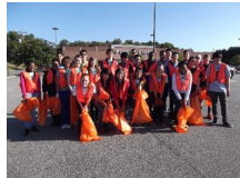
Last Year's Litter Sweep Event

As the winter snow finally melts away, we look forward to spring and outside events. The Town of Jamestown is ready to get out doors and soak up some sunshine. Traditionally, the Town of Jamestown celebrates Arbor Day on the first Friday following March 15th. This is the date the state of North Carolina recognizes as Arbor Day. However, National Arbor Day is designated as the last Friday in April. This year Jamestown will celebrate National Arbor Day on Friday April 24th, 2015. There will be a tree planting at the Wrenn Miller Park and planting of flowers at the Town Hall municipal campus. We are fortunate to have the Ragsdale High School H. O. P. E. Club (Help Our Planet Earth) and their Advisor to participate and help Town staff with the plantings. The H. O. P. E. Club has been a loyal participant and the Town is grateful to the students that attend each year.