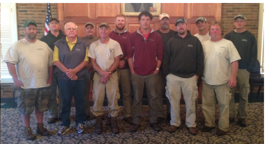
Parks and Recreation