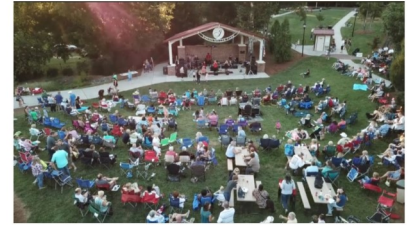
Comprehensive Annual Financial Report For the fiscal year ended June 30, 2019