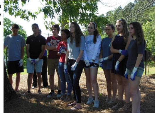
Ragsdale High School H.O.P.E Club planted trees for Arbor Day 2016

Tree City USA boasts their smallest participant as Sibley, ND with 28 residents and its largest as New York City with more than eight million. A complete list of Tree City USA communities and their anniversaries can be found at www.arborday.org . The Arbor Day Foundation, in partnership the U.S. Forest Service and the National Association of State Foresters, is celebrating 40 years of the Tree City USA program. During the last 44 years, more than 250 million Arbor Day Foundation trees have been planted in neighborhoods, communities, cities and forests throughout the world.