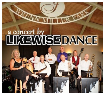
Likewise Dance June 18th