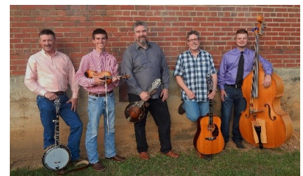
Rich in Tradition July 23rd