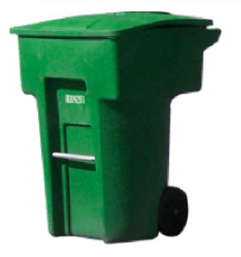
Green cans are for garbage

Both garbage and recycling will be collected on the same day. Cans must be at the curb by 7 AM to ensure pickup. Collection days will change. Visit the website or call 336-454-1138 to determine which day your solid waste will be collected.