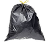
All plastic bags and mirrors or window glass.