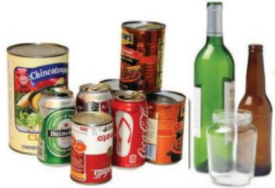
Aersol cans, aluminum cans & foil, glass, and steel cans

Place only these materials loose, empty, clean and dry in your recycling cart or dumpster: