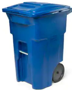
Blue cans are for recycling

All garbage must be in the can. Items left outside the can will not be collected.