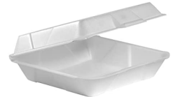
All styrofoam-style containers