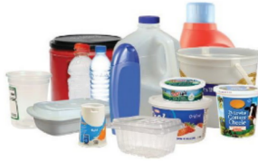
Household Plastics #1-7