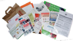
Paper, paperboard, phonebooks, magazines, & mail