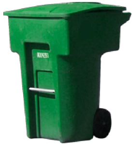
Green cans are for garbage

PRSTD STD US POSTAGE PAID Permit #29 Jamestown, NC