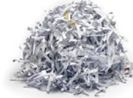
Shredded paper and all food wastes

Keep these items out of your recycling cart or dumpster: