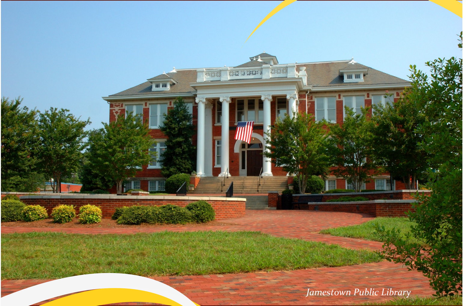
Jamestown Public Library