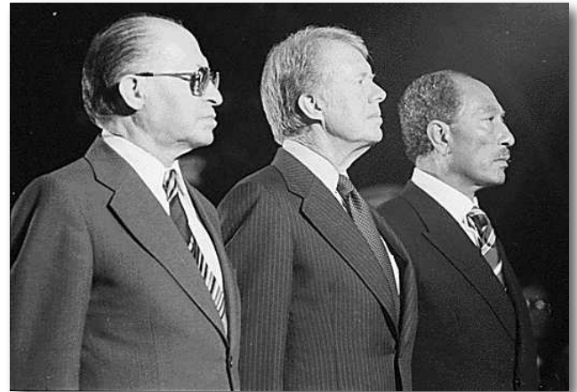
Menachem Begin, Jimmy Carter and Anwar Sadat at Camp David

What were the concerns from each side? _____