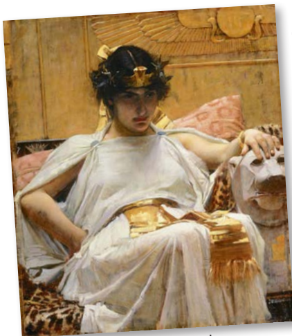
Cleopatra by John William Waterhouse

Why do you think it's important for cultural diffusion to happen? What are the benefits?