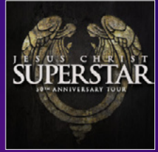
Jan 23 - 28, 2024 Buell Theatre