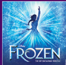
Jun 20 - 30, 2024 Buell Theatre