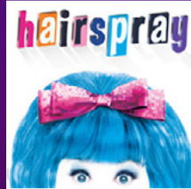
Mar 5 - 10, 2024 Buell Theatre