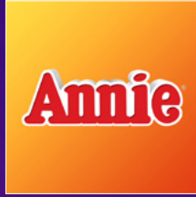
Nov 21 - 26, 2023 Buell Theatre