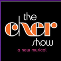
May 3 - 5, 2024 Buell Theatre