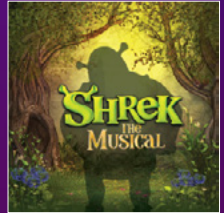
Mar 14 - 17, 2024 Buell Theatre