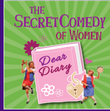
Jan 3 - 28, 2024 Garner Galleria Theatre