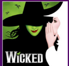
Jul 24 - Aug 25, 2024 Buell Theatre

To learn more about becoming a DCPA subscriber visit DENVERCENTER.ORG/SUBSCRIBE