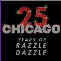
Jan 30 - Feb 4, 2024 Buell Theatre