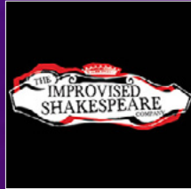
Feb 7 - Mar 31, 2024 Garner Galleria Theatre