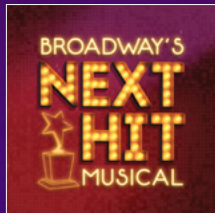
Jun 12 - 30, 2024 Garner Galleria Theatre