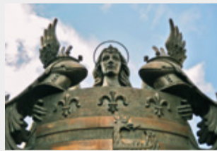
Košice's Coat of Arms Arpád Račko, 1999