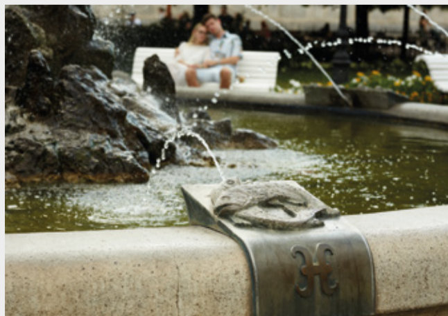
Zodiac Fountain Arpád Račko, 1995