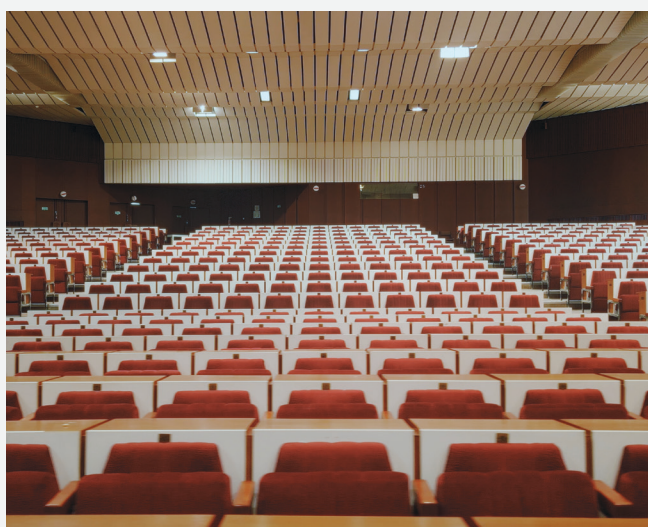
CITY HALL OF KOŠICE MILAN MOTÝL, 1985