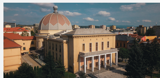
PALACE OF ARTS ĽUDOVÍT KOZMA, 1927