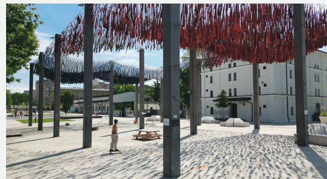
DARGOV DEPARTMENT STORE FRANTIŠEK ANTL, 1987