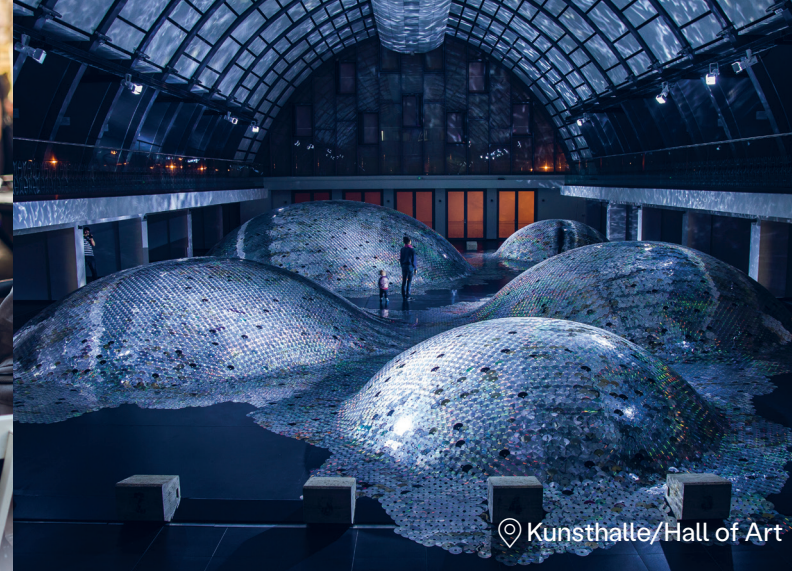
Kunsthalle/Hall of Art

Enjoy your afternoon in one of the most impressive galleries in Slovakia, located only a minute from St Elisabeth's Cathedral. The East Slovak Gallery regularly exhibits new and well-known artists and their works from the older to contemporary periods. Today, you may also spend some time in the recently-opened library with specialized literature and pop-up shop, as well as the inner courtyard where you may relax and savor your coffee. Close up your artsy day in the attractive Kunsthalle/Hall of Art and explore the artworks by local and foreign contemporary artists.