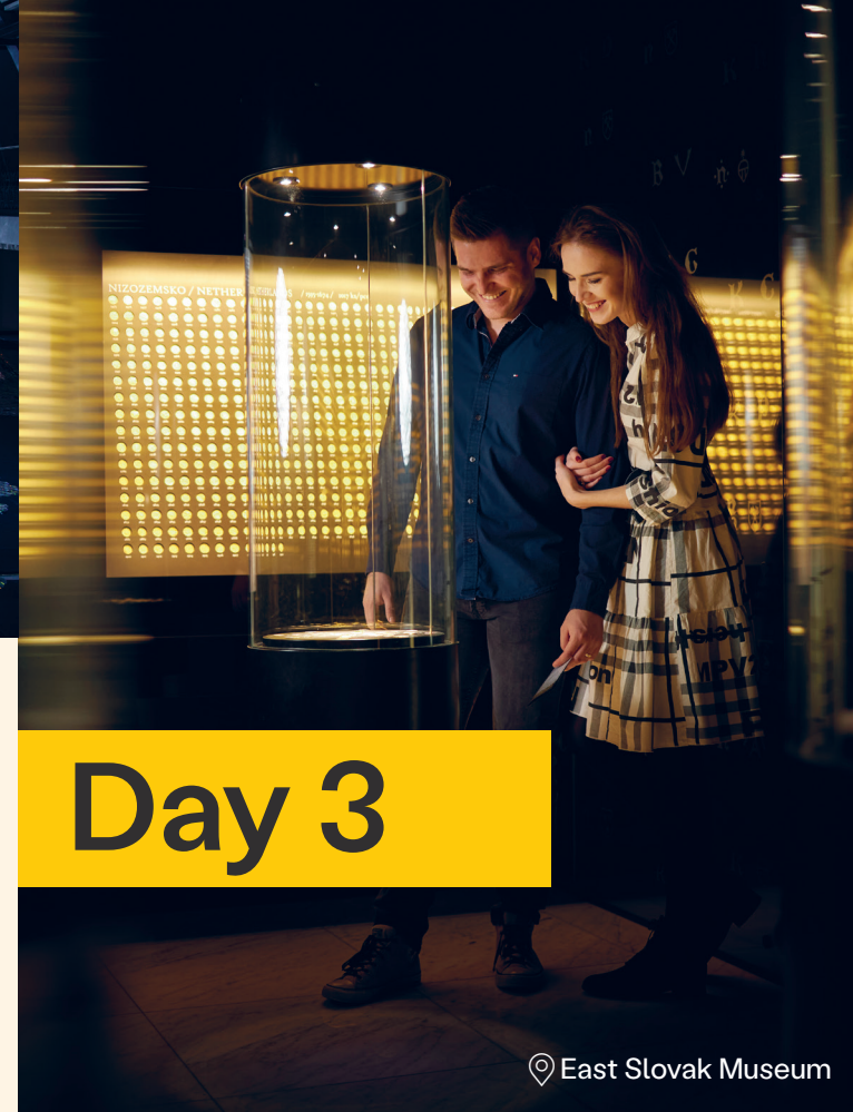
East Slovak Museum

Spend your last day discovering the unknown! One of the great options for you is to visit the East Slovak Museum , which hosts one of many historical gems of the city— Košice Golden Treasure . Unearth the treasure chest of 2920 coins, three golden medals, and a Renaissance chain. Find the three-meter-tall statue of the Marathonian in front of the museum, forever frozen in his finishing posture, which reminds locals and visitors of the annual sports events, Košice Peace Marathon , the oldest marathon in Europe and the third oldest marathon in the world.