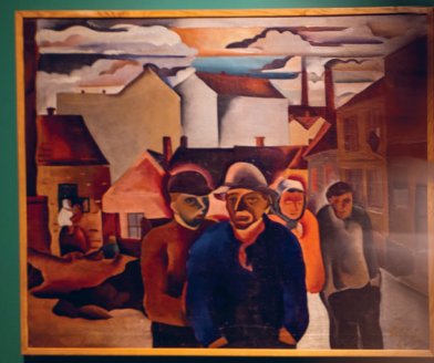
East Slovak Gallery

Start your day with a slow breakfast at the Dominican Square and explore the breakfast or brunch menu options at one of the local venues. Sip on your favorite morning booster drink and croissants while observing the colors of the local market with its local vendors of flowers, vegetables, or homemade pasta. The oldest church in the city, the Dominican Church , only adds to the almost-like coastal atmosphere of Košice, as well as the loud dialogues of the local passersby. Combine your breakfast experience with the visit of the Archaeological Museum—Lower Gate close by.