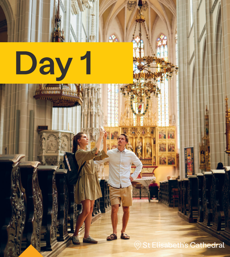
St Elisabeth's Cathedral

Suppose you wish to experience the unique character of Košice. In that case, you should definitely start your traveling journey on Hlavná (Main) St. Stop by Visit Košice Infopoint on Hlavná 59—your entrance gate for discovering the city , where you can obtain free brochures, maps, and, most importantly, tips on the best leisure time approved by locals as well as booking your very own sightseeing tour with one of our tour guides.