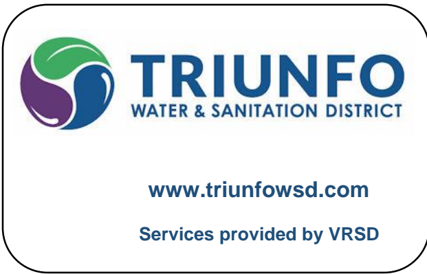
Magnetic sign for vehicles