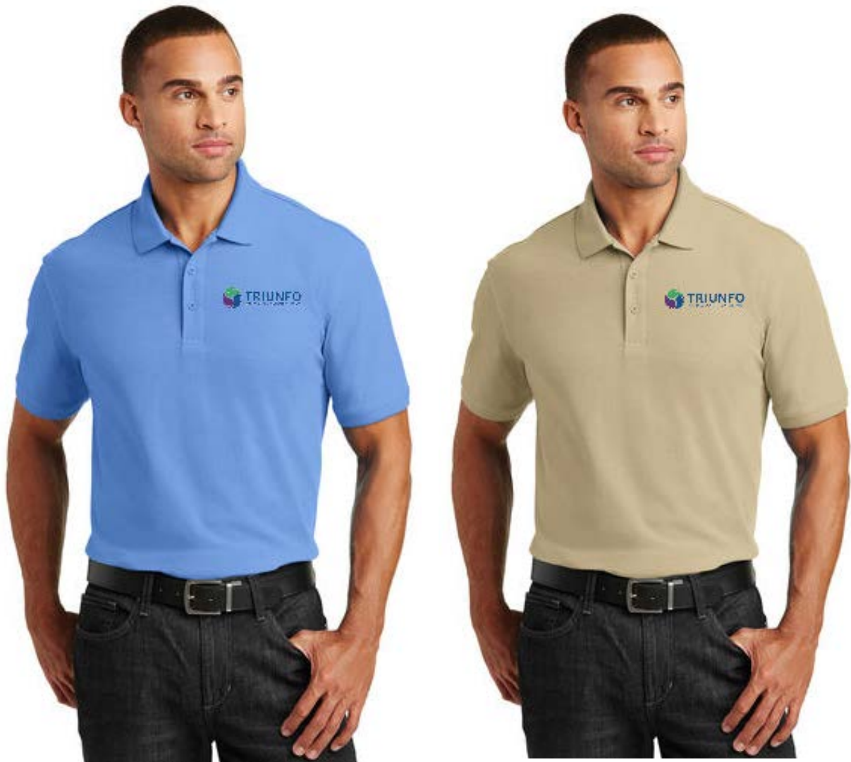
K100 – Port Authority Core Classic Pique Polo ($17.50)