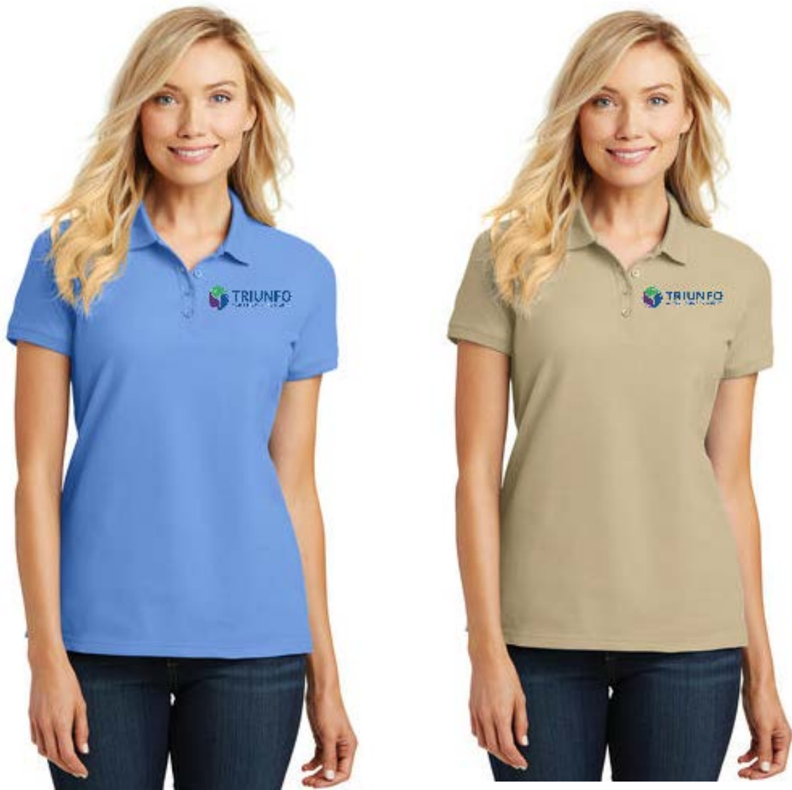
L100 – Port Authority Ladies Core Classic Pique Polo ($17.50)