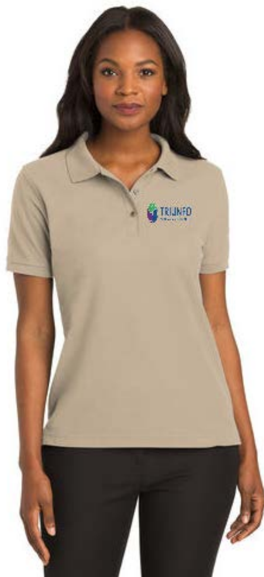
L500 – Port Authority Ladies Silk Touch Polo ($19.50)