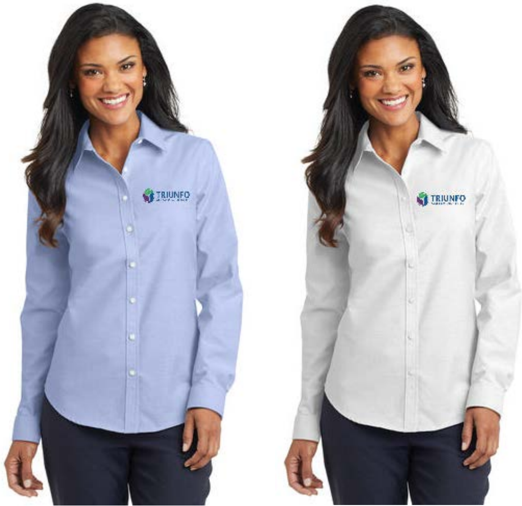
L658 – Port Authority Ladies Super Pro Oxford Shirt ($30.60)