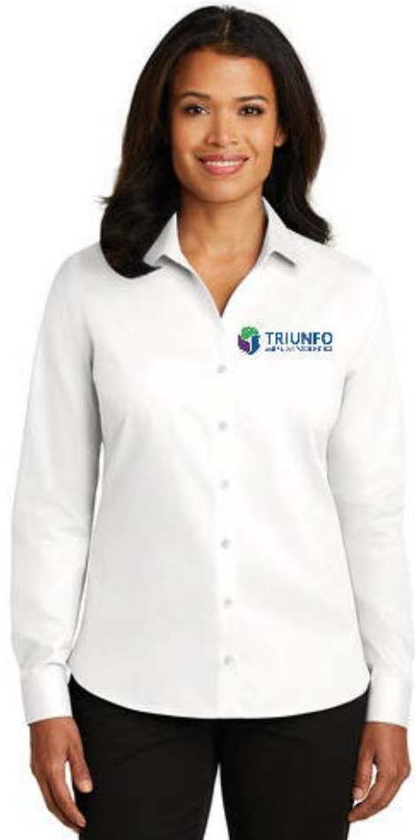
RH79 – Red House Ladies Non-Iron Twill Shirt ($38.00)