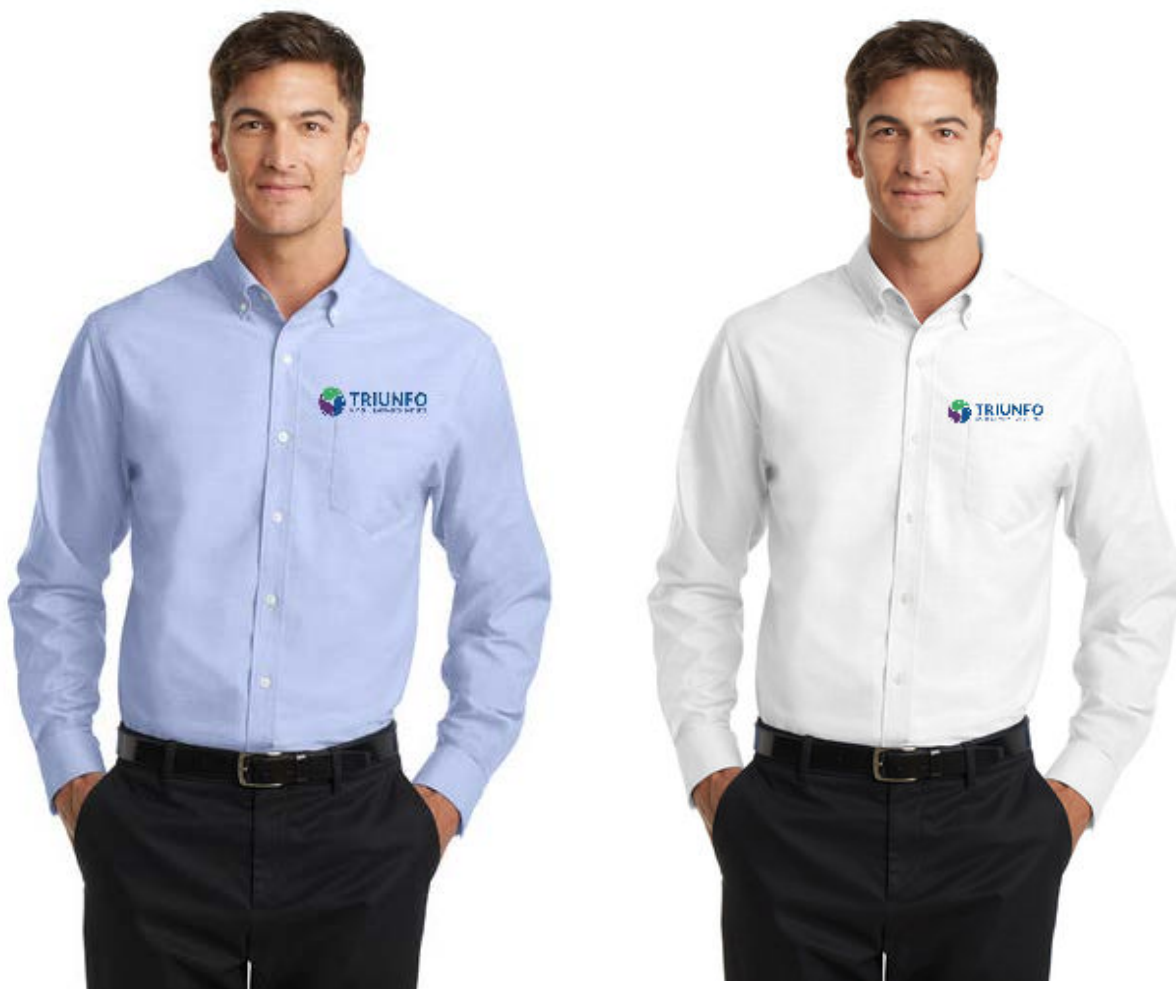
S658 – Port Authority Super Pro Oxford Shirt ($30.60)