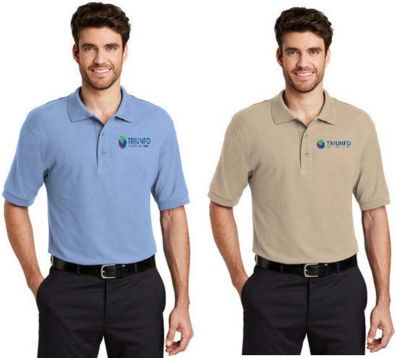
K500 – Port Authority Silk Touch Polo ($19.50)