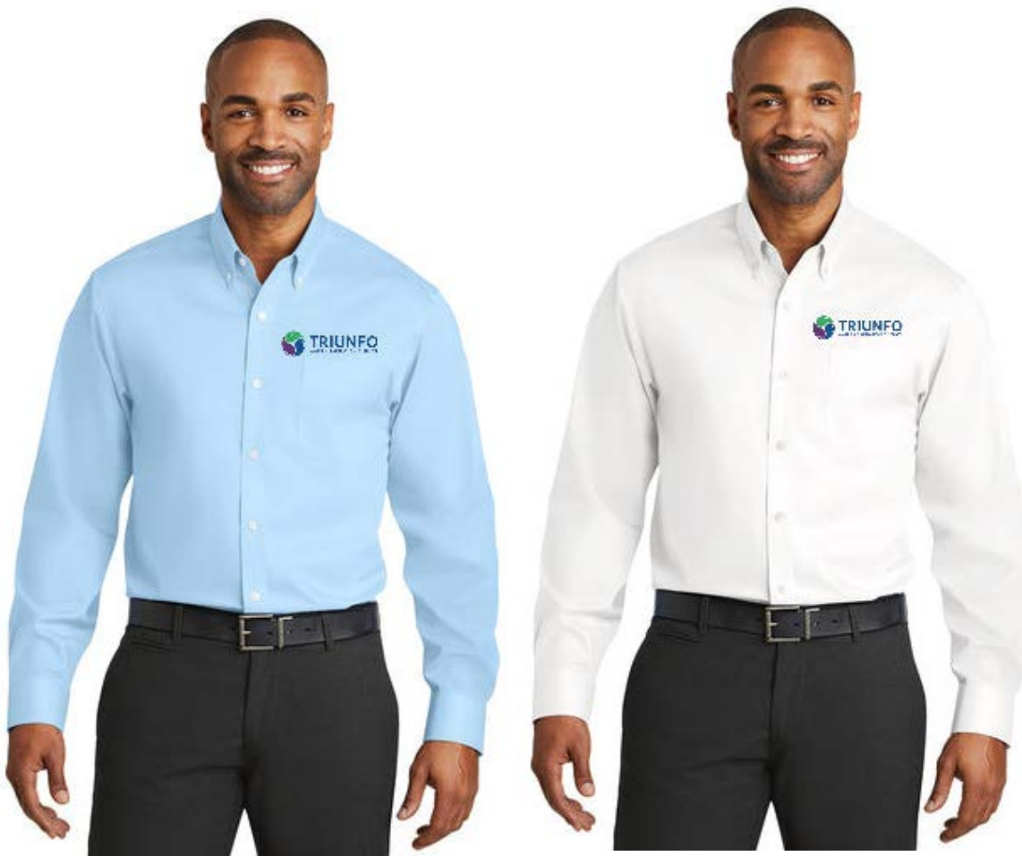
RH 78 – Red House Non-Iron Twill Shirt ($38.00)