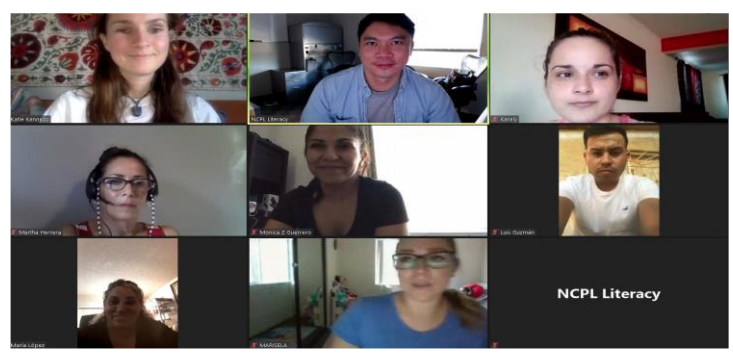
Zoom Tutoring Session