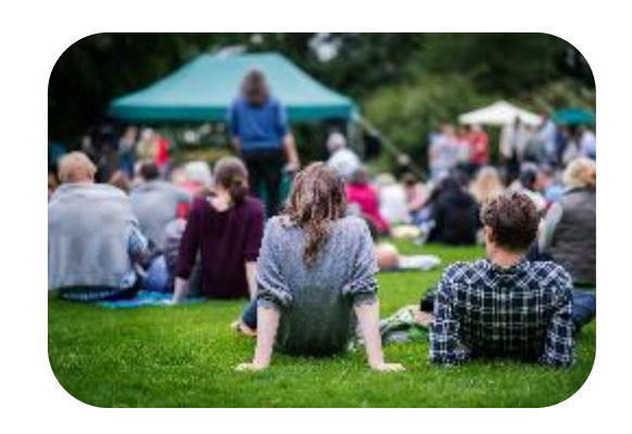
Open to the Public