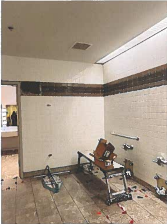
Restroom Demo/Tile Work