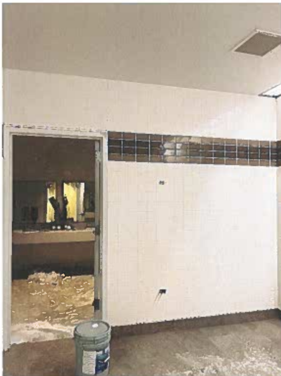
Restroom Demo/Tile Work: Photo taken by WCC Staff