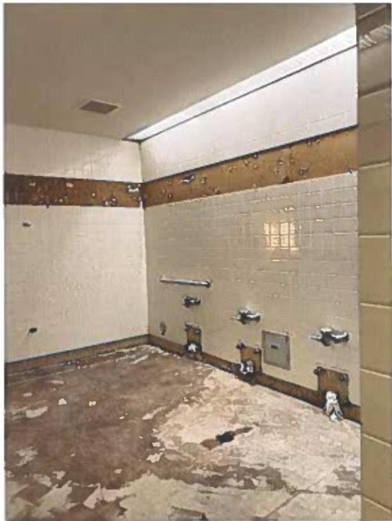
Restroom Demo/Tile Work: Photo taken by WCC Staff