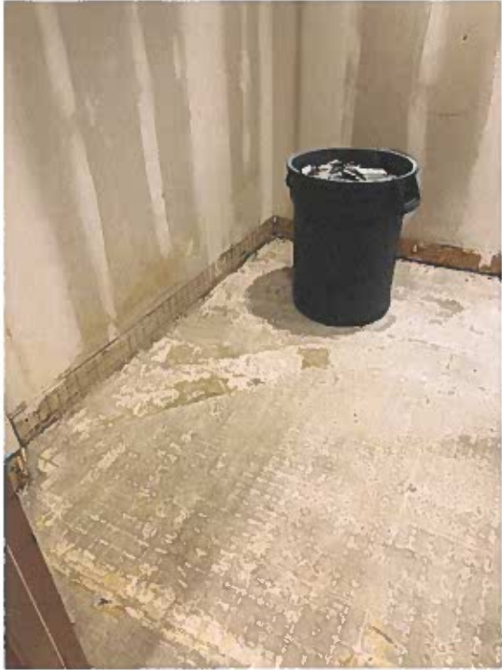
Restroom Demo: Photo taken by WCC Staff