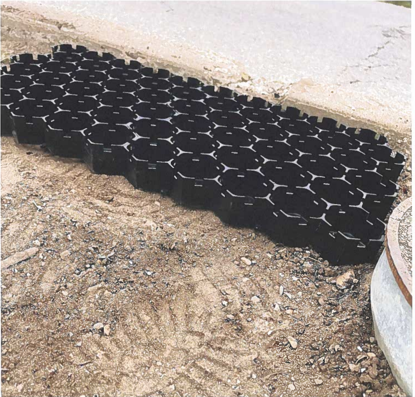
70,000 PSI per square foot Grass Cell Paver