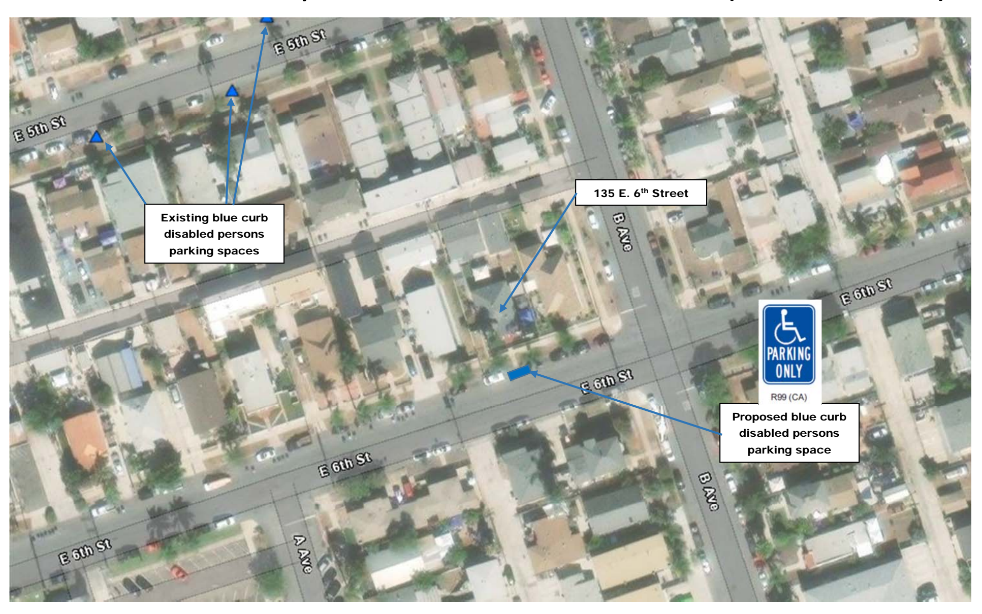
Exhibit A: Location Map with Recommended Enhancements (TSC Item: 2023-11)