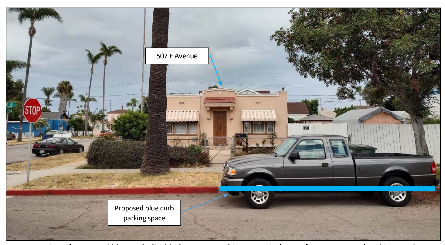
Location of proposed blue curb disabled persons parking space in front of 507 F Avenue (Looking East)