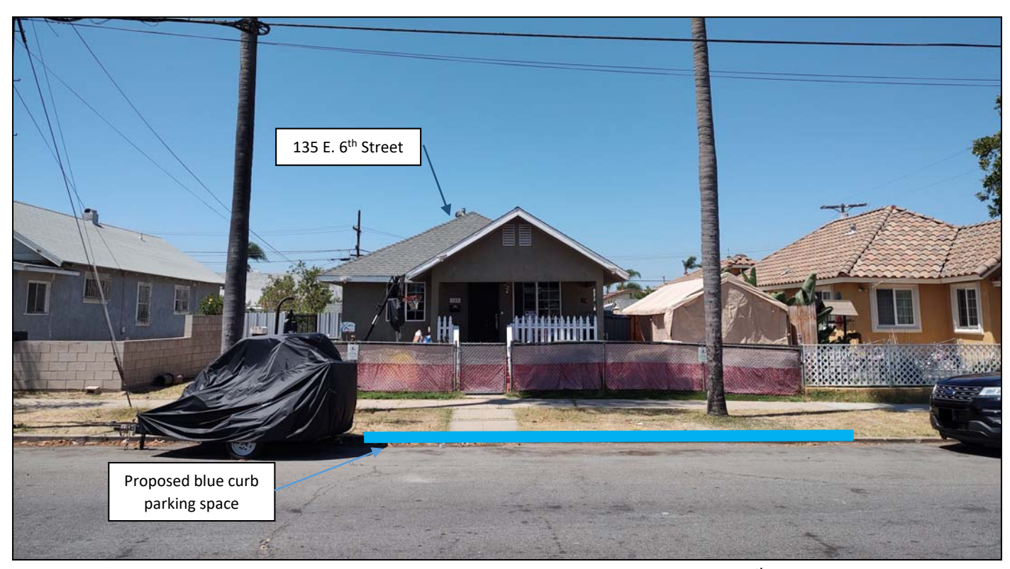
Location of proposed blue curb disabled persons parking space in front of 135 E. 6th Street (Looking North)