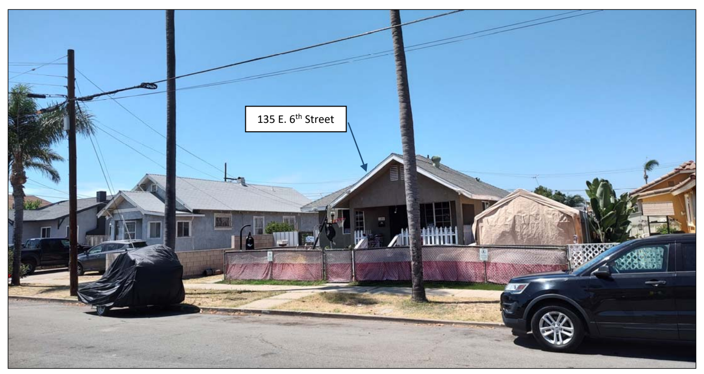
Photo of residence at 135 E. 6<sup>th</sup> Street (Looking North)