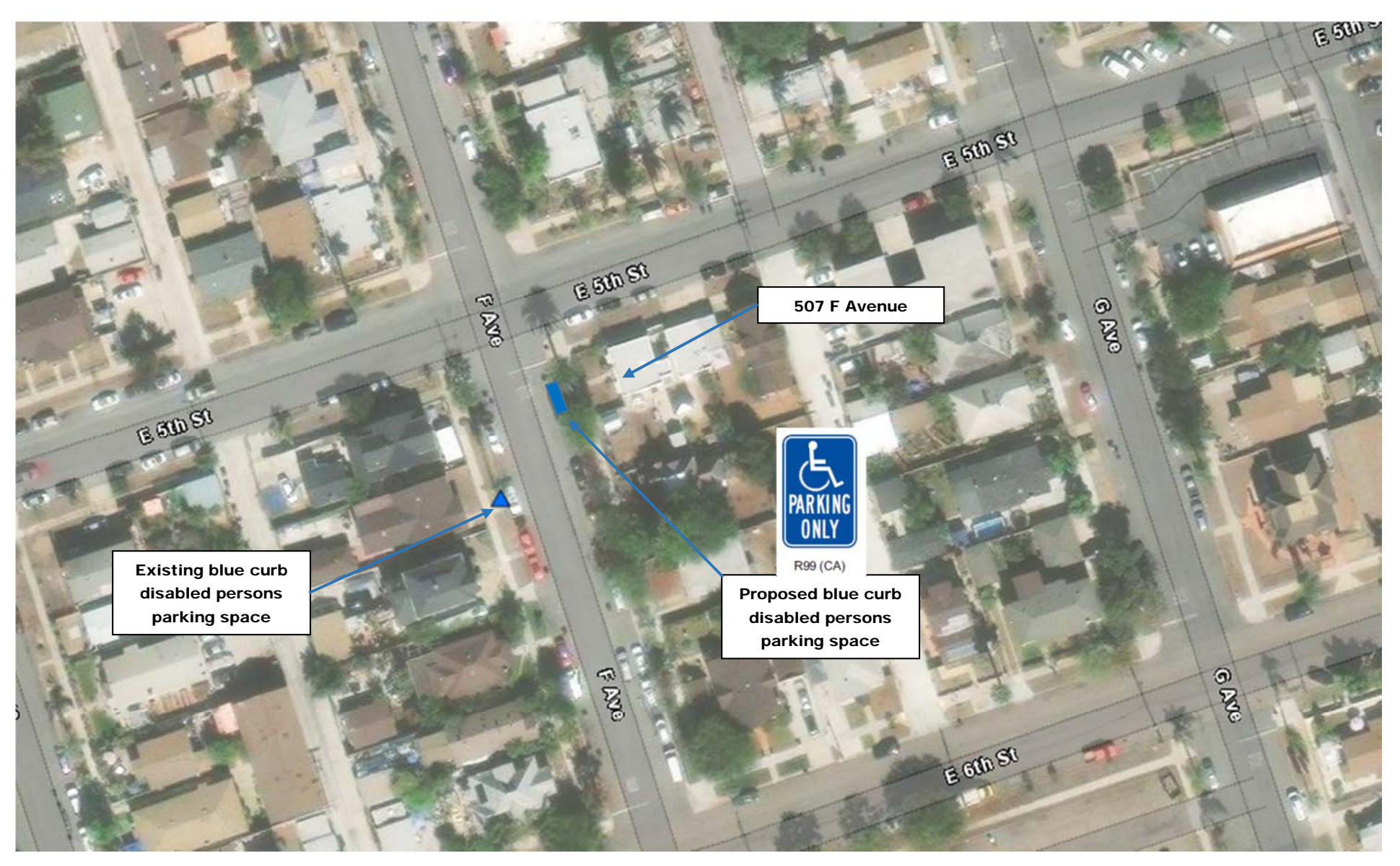
Exhibit A: Location Map with Recommended Enhancements (TSC Item: 2023-10)