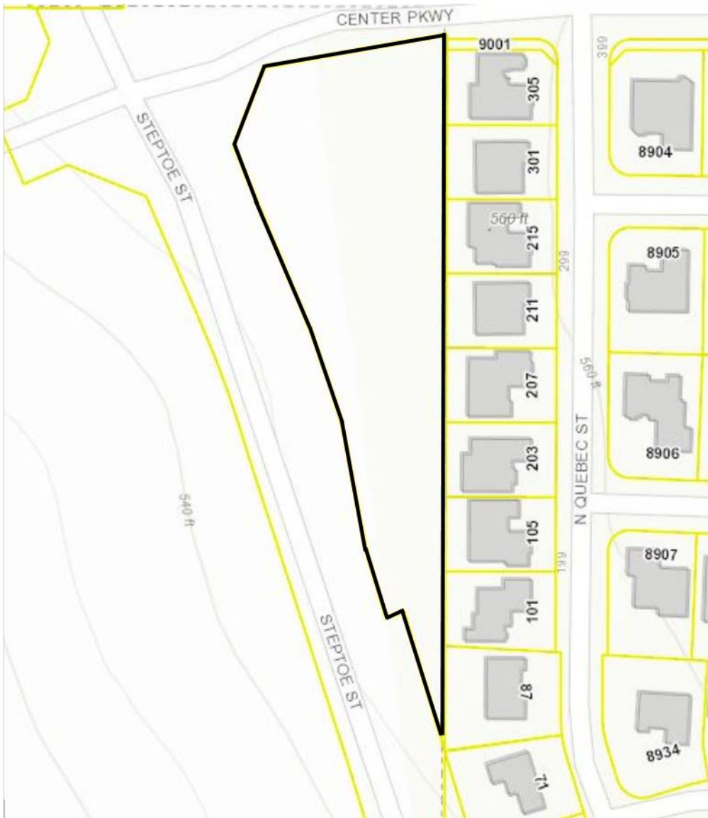
Exhibit A, Map