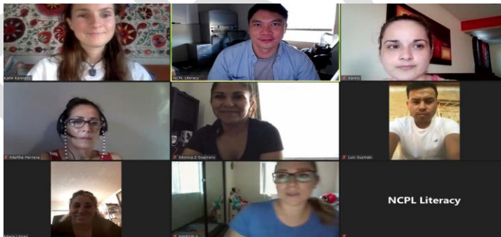
Zoom Tutoring Session