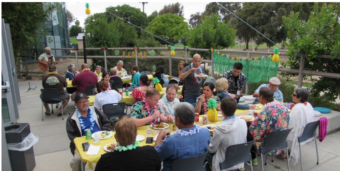
Volunteer Appreciation Night