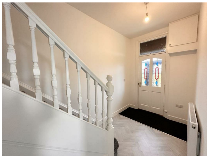
With stairs off, radiator, cushioned floor and under stairs storage.