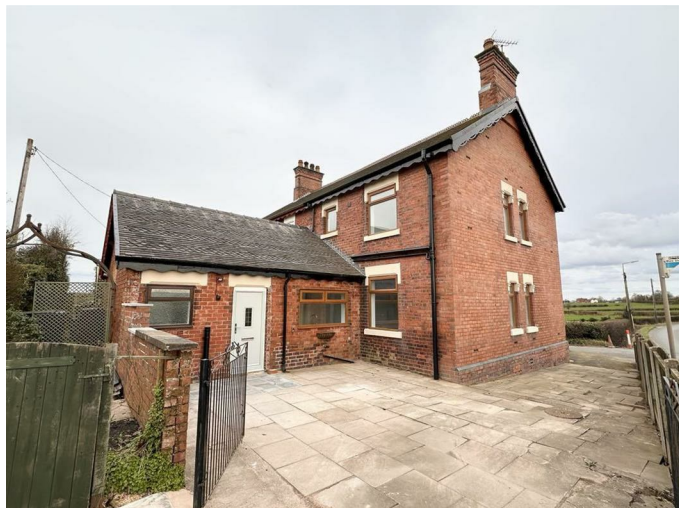
A front entrance porch with tiled floor