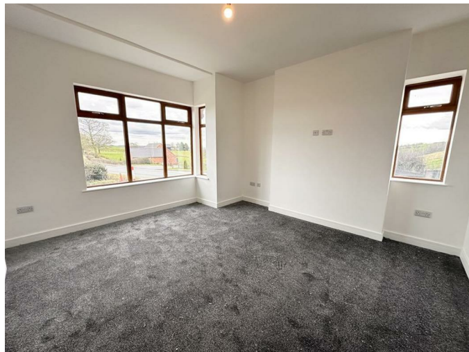
The living room has a UPVC double glazed bay window to the front aspect, UPVC double glazed window to the side aspect, radiator and newly fitted carpet.