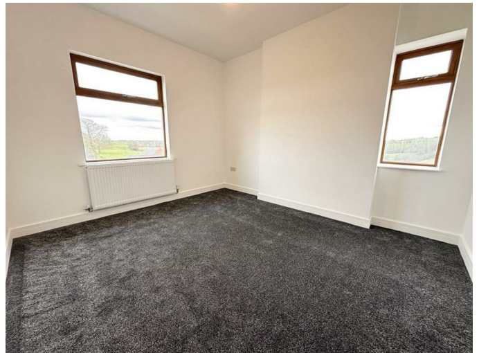
Bedroom One 11'10" x 10'6" (3.62 x 3.21)

With UPVC double glazed windows to the front and side aspects, newly fitted carpet, and radiator.