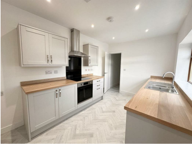
Kitchen 13'5" x 8'7" (4.11 x 2.62)

The newly fitted kitchen provides a range of base cupboards and drawers with matching wall mounted cupboards, built in electric oven with four ring electric hob and extractor fan above, work tops with one and half bowl sink, cushioned floor, radiator and UPVC double glazed window and external door to the side aspect.