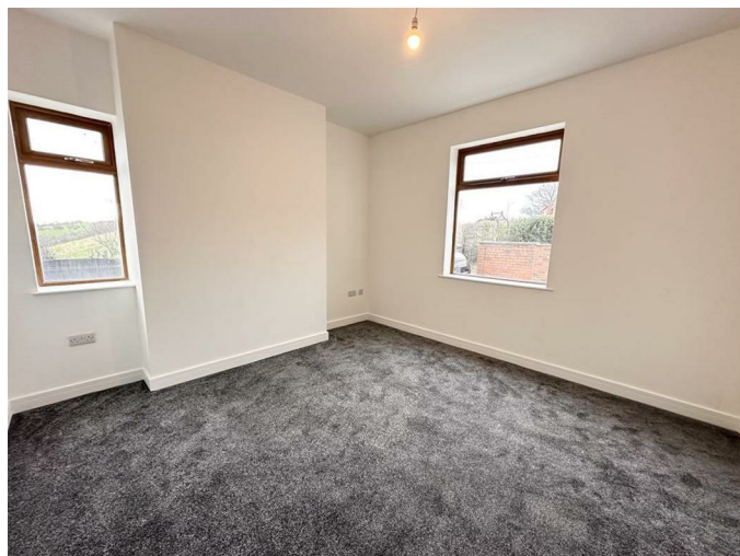
With UPVC double glazed windows to the rear and side aspect, newly fitted carpet, and radiator.