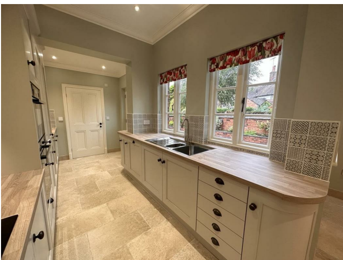
First Floor Landing With fitted carpet.