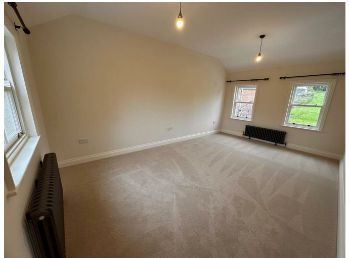
Master Bedroom 17'8" x 11'4" (5.41 x 3.47)

Double glazed sash windows to front and rear, antique radiator, loft access.