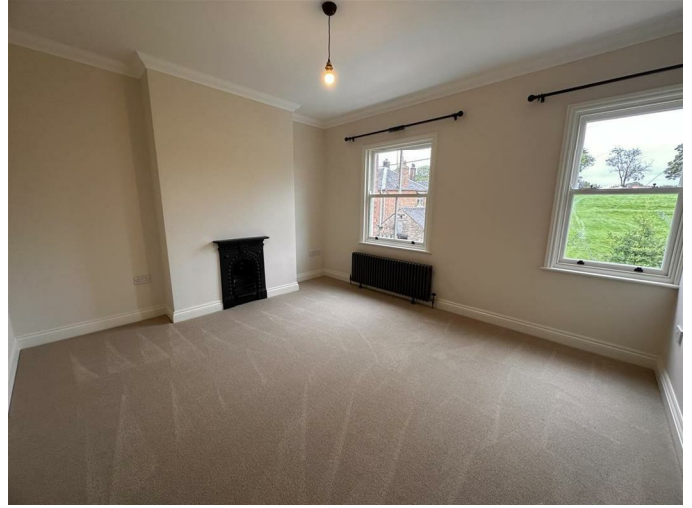
Bedroom Two 13'11" x 12'4" (4.26 x 3.76)

Two double glazed sash windows to front, antique radiator, ornamental fireplace.