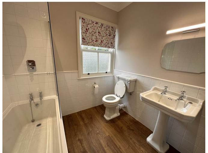
Bathroom 7'7" x 7'7" (2.33 x 2.32)

White suite comprising panelled bath with mixer shower over, low level wc, pedestal wash hand