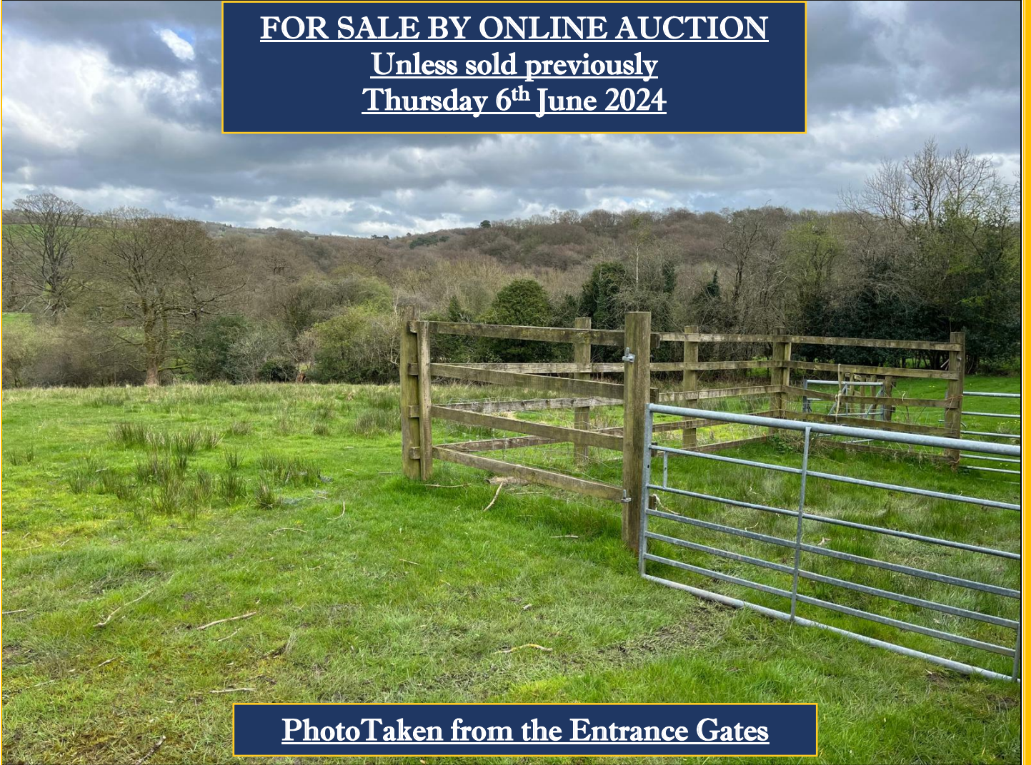
Photo Taken from the Entrance Gates

Unless sold previously Thursday 6 th June 2024