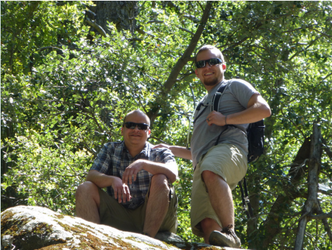
Camping/hiking with brother