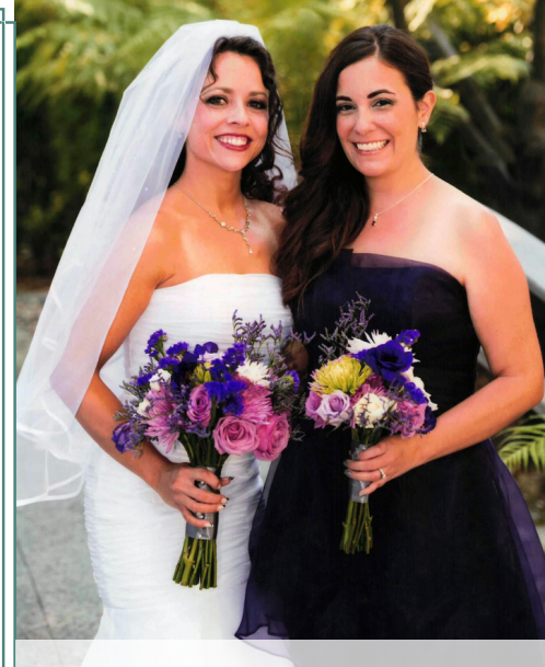
My cousin's bridesmaid

Education: B.S. in Child Development, Master's in Teaching Interests: Board Games, Reading, Crafts/Scrapbooking Fun Facts: Studied abroad in Italy, Started after school program for kids called GameMasters