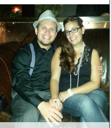
20s Themed Party