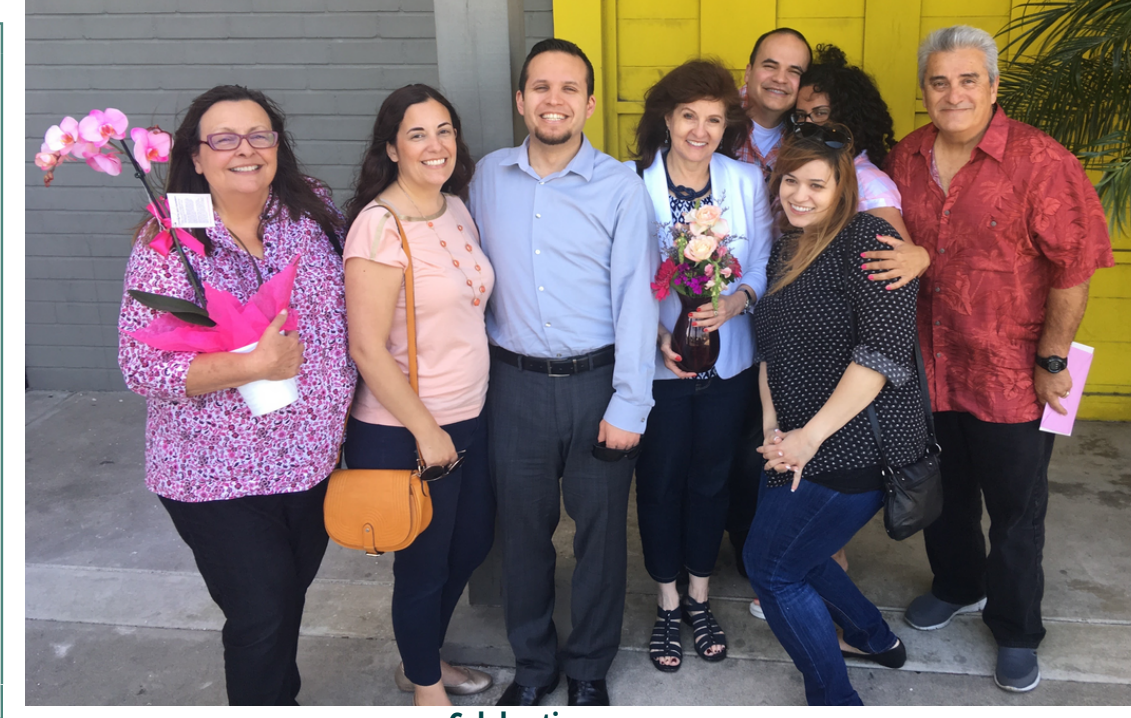
Celebrating our moms

We were both close to our families growing up, with several extended family members nearby. Each of our grandparents helped raise us, and their homes were like second homes to each of us. We are lucky to still have our families nearby and see them on a regular basis for holidays, celebrations, and regular get-togethers.