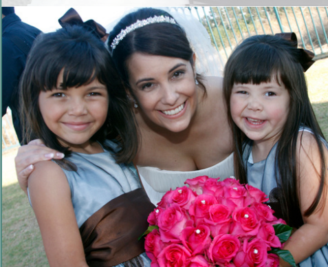
Little cousin flower girls