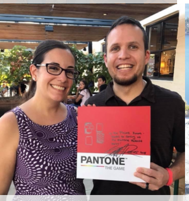
Board Game Event

Met: Summer 2004 Engaged: July 25, 2008 Married: July 24, 2010 Fun Facts: Own over 100 board games, Started board game parlor pop-up