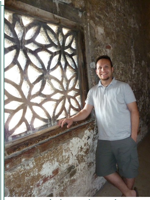
Exploring Venice, Italy

Occupation: Solutions Architect Education: B.S. in Business Information Systems Interests: Computers/Technology, Woodworking, Singing, Board Games, Hiking, Camping, Traveling Fun Facts: Grew up in Venezuela, Speaks Spanish, Appeared on 1st episode of American Idol