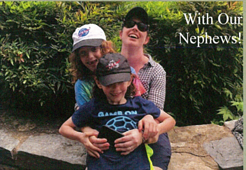
With Our Nephews!