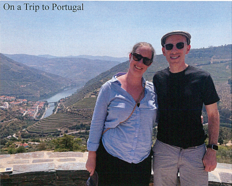
On a Trip to Portugal