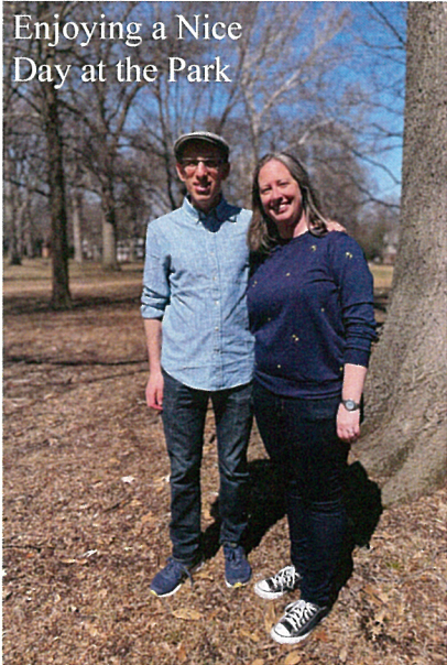
Enjoying a Nice Day at the Park

Our friends and family include many people who are Jewish like us, and also many who are not, with many people from all over the country and the world. We love that we have opportunities among our familial and social circles both to share our heritage and learn about others.