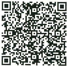
Scan to view video profile