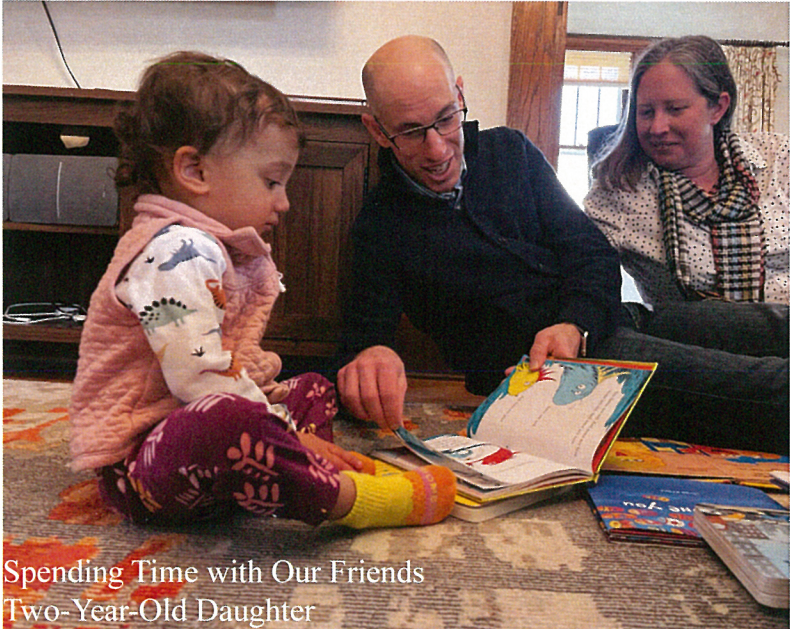
Spending Time with Our Friends Two-Year-Old Daughter