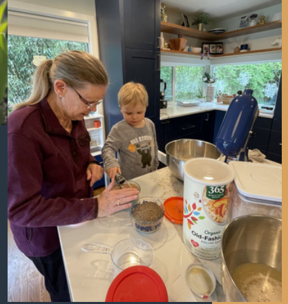
baking with Nonnie