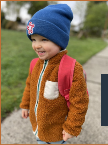
Go to pre-school for 3 hours or go on an adventure to the zoo, a beach, fire station, etc.