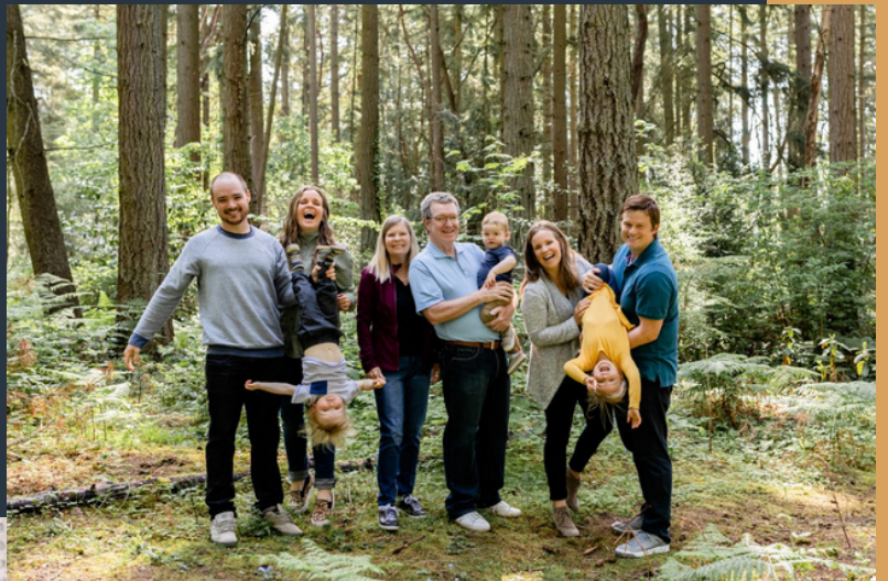
silly family photos in the forest near our homes