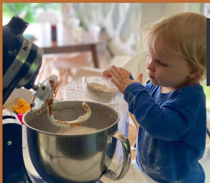
Make lunch, do some baking or art or science. Help tidy up, read and take a rest.