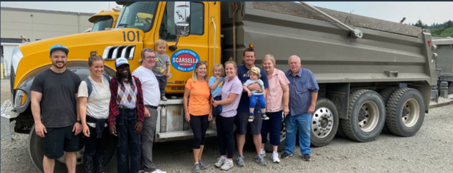
Visiting our friend's huge truckyard - it's better than Disneyland