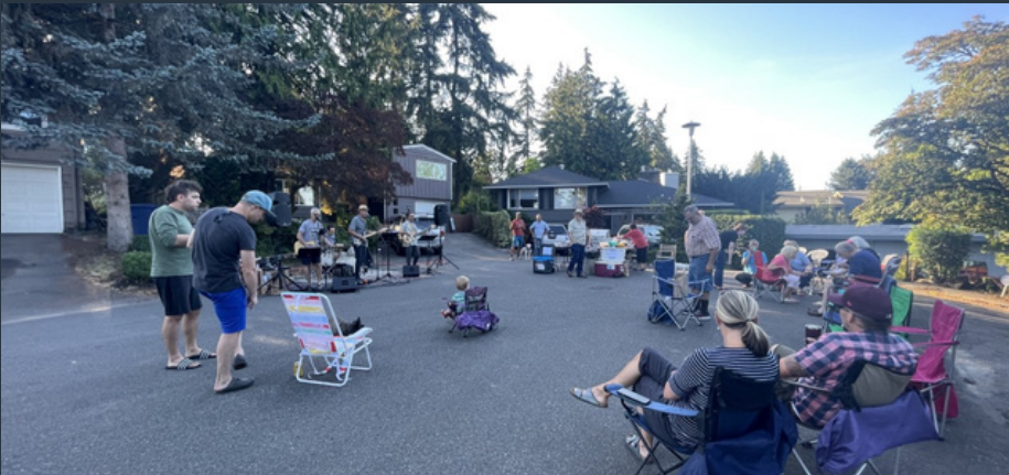
Our annual cul-de-sac potluck party with a live band, chalk-art, water-balloons and tons of fun!