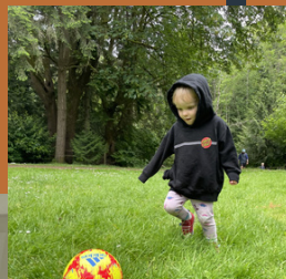
Watch Boppa do a puppet show, soccer practice, go swimming, ride bikes in the cul-de-sac.