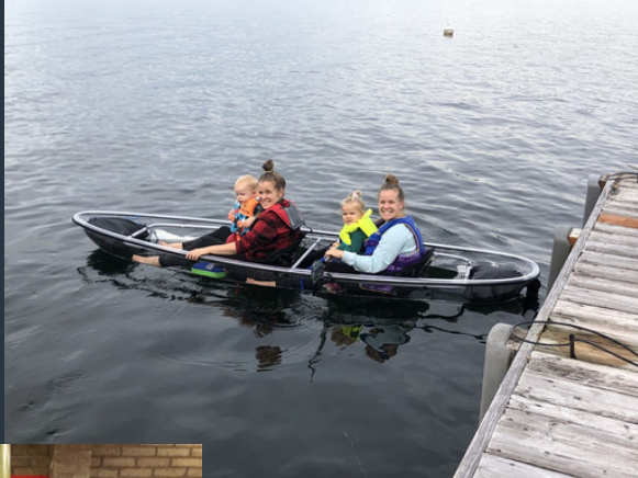
canoe ride at Boppa & Nonnie's house