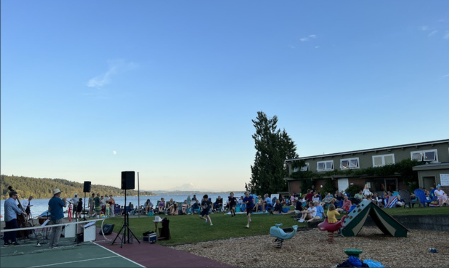
Our local beach club where we spend every day in the summer in the pool and lake. Music Mondays are great for kid-dancing!