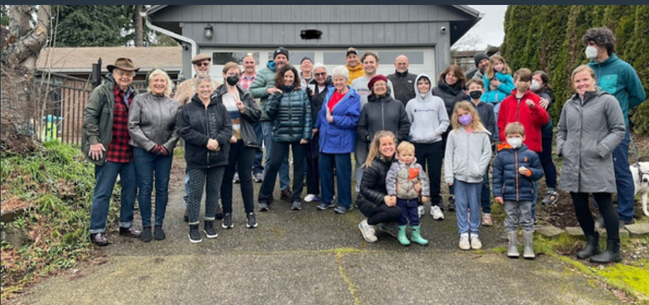
Our awesome neighbors who are members of our extended family at Benji's cul-de-sac birthday party