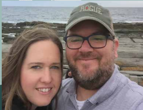
Traveling in Maine