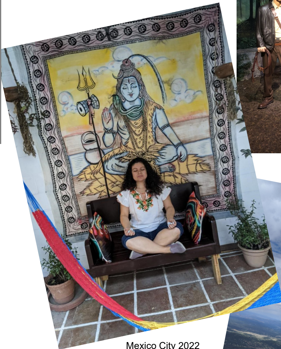
Mexico City 2022