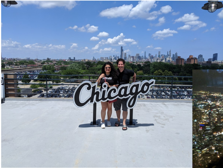
Chicago White Sox game July 2019