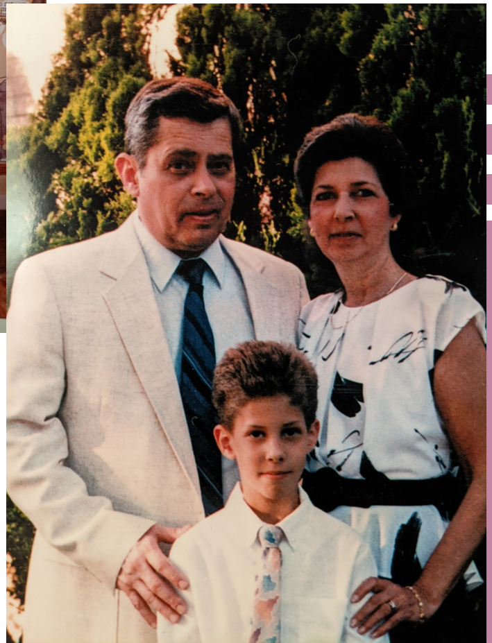
Mom, Dad & Me