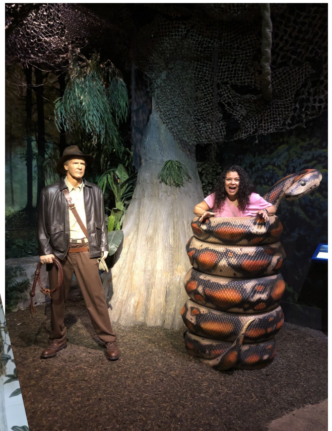
Hollywood Wax Museum 2022