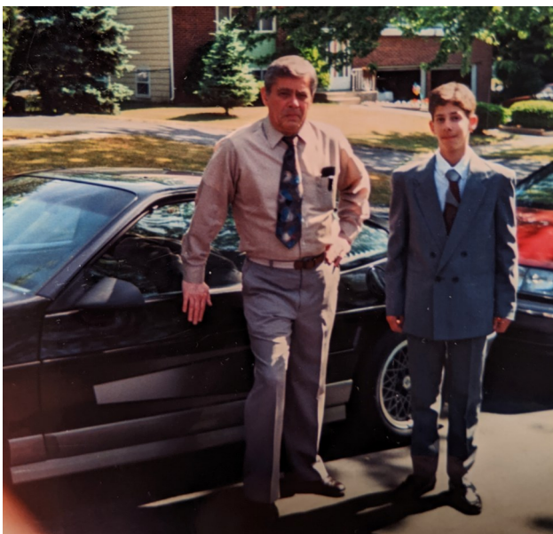
Father & Son