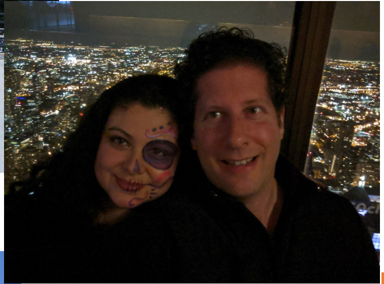
John Hancock Observatory