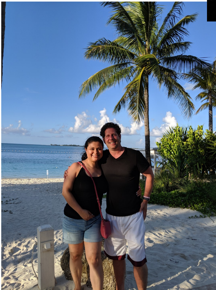
Honeymoon July 2019 Bahamas