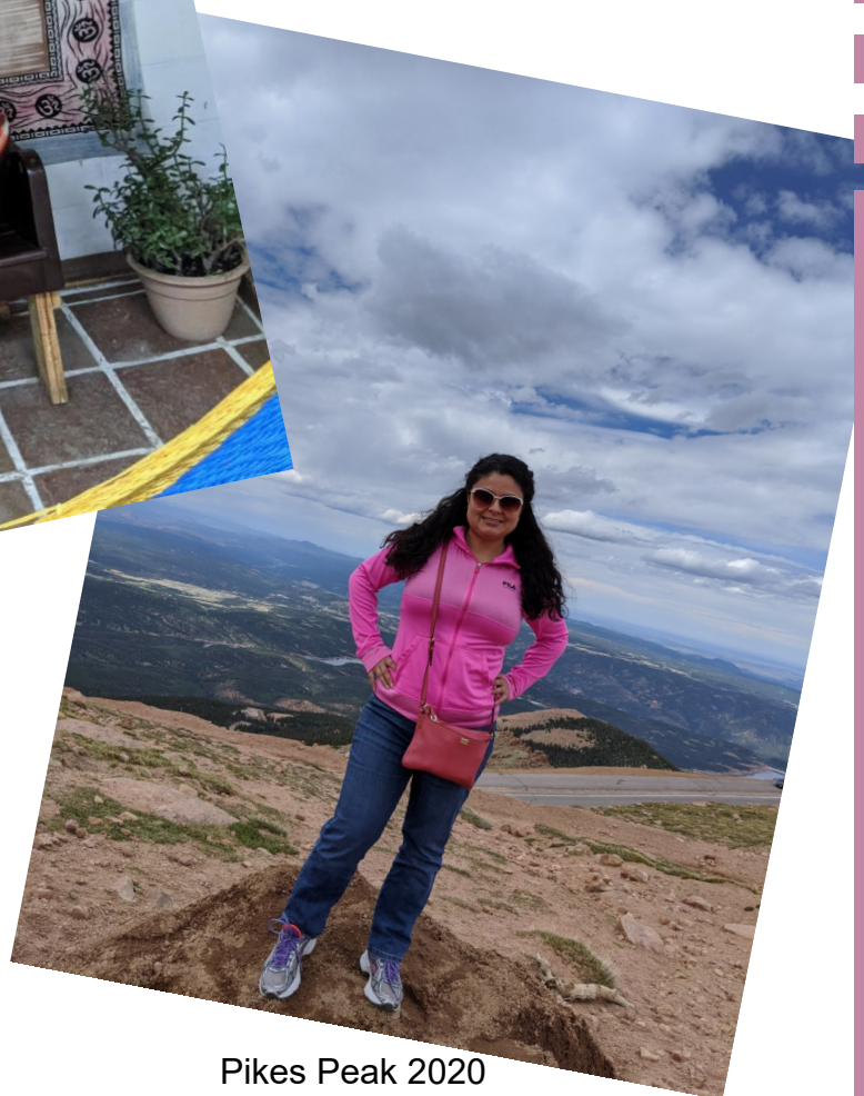
Pikes Peak 2020