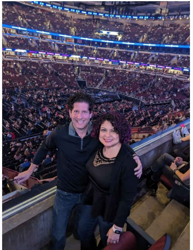
United Center Chicago at a music concert.