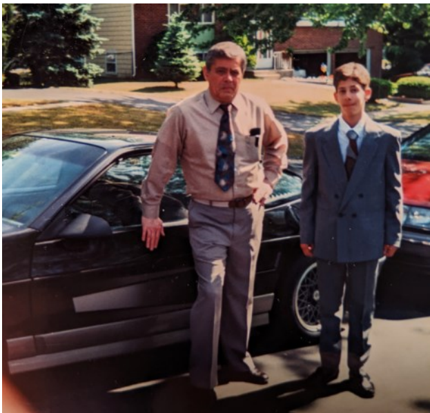
Father & Son