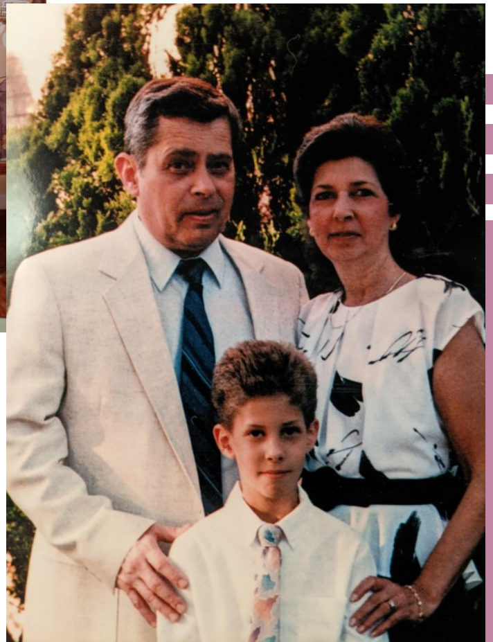
Mom, Dad & Me