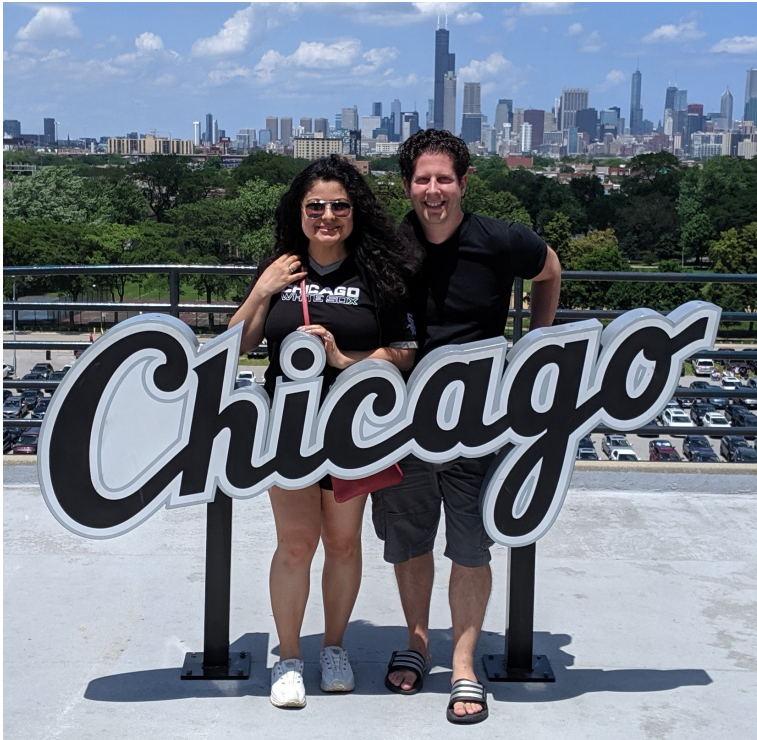
Chicago White Sox game