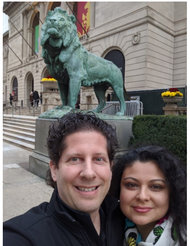
In front of the Art Institute of Chicago