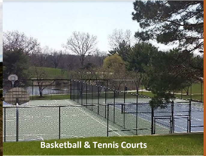
Basketball & Tennis Courts