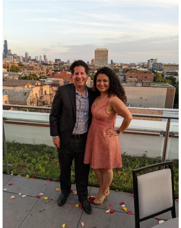
Family Wedding Chicago Rooftop