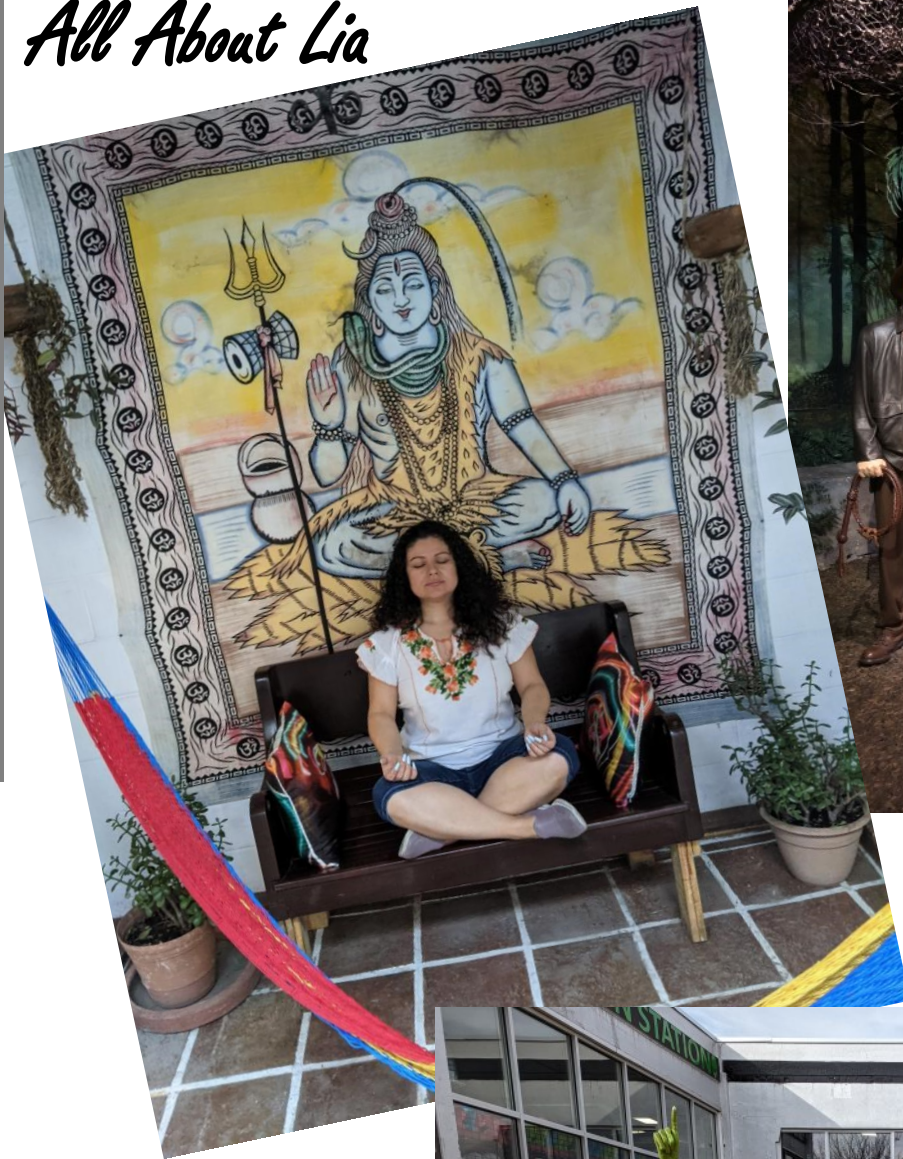
Mexico City Meditating