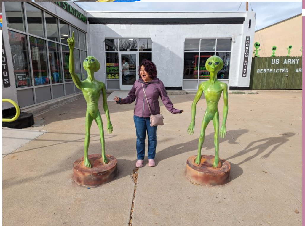
Roswell, New Mexico making new friends