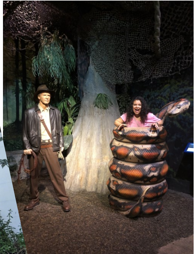
Hollywood, CA Wax Museum