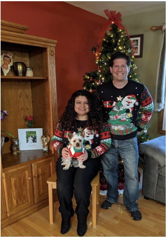
Christmas through the years