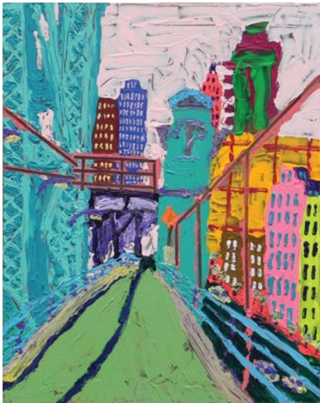
ONE OF MY PAINTINGS