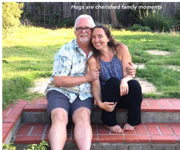
Hugs are cherished family moments