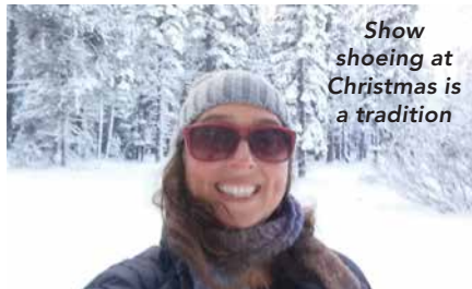
Show shoeing at Christmas is a tradition