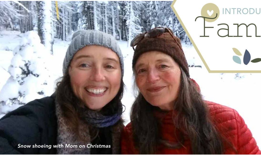
Snow shoeing with Mom on Christmas