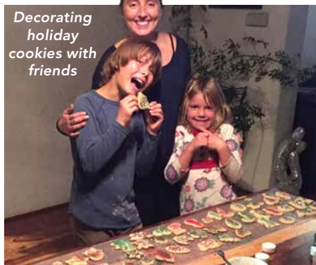
Decorating holiday cookies with friends