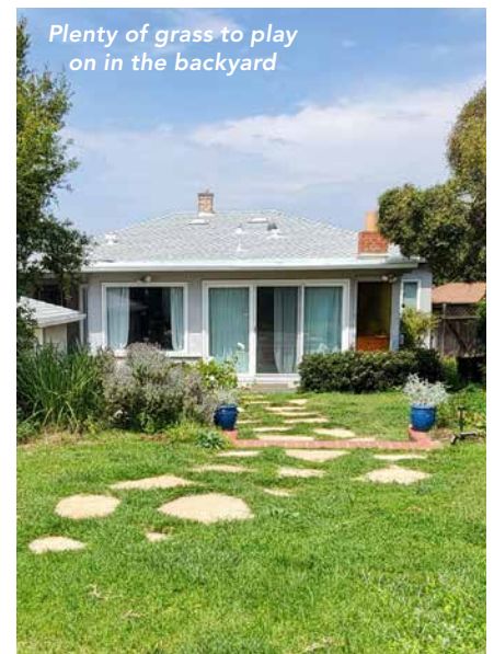
Plenty of grass to play on in the backyard