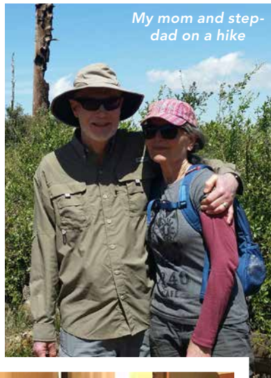
My mom and step-dad on a hike