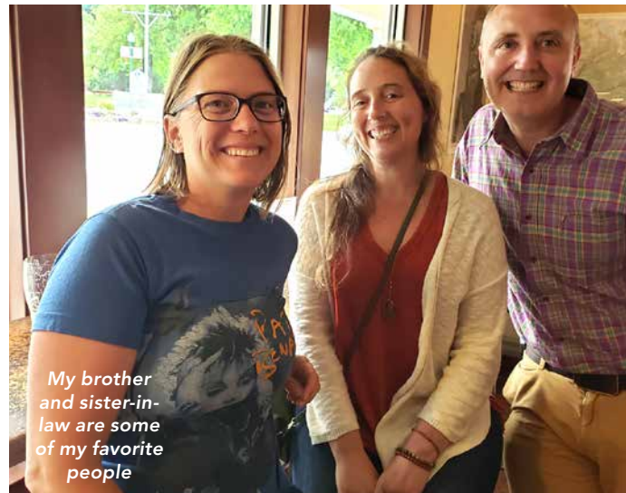
My brother and sister-in-law are some of my favorite people