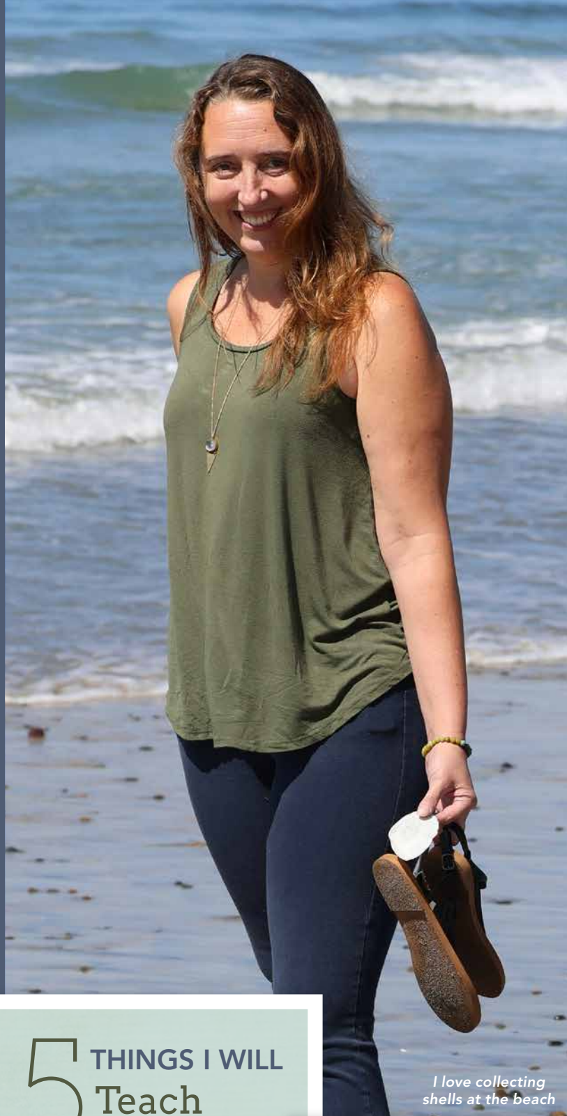
I love collecting shells at the beach