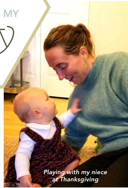
Playing with my niece at Thanksgiving