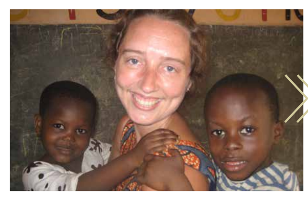
They'll always have a piece of my heart

I AM THANKFUL for your consideration and the opportunity for you to get to know me a little more.