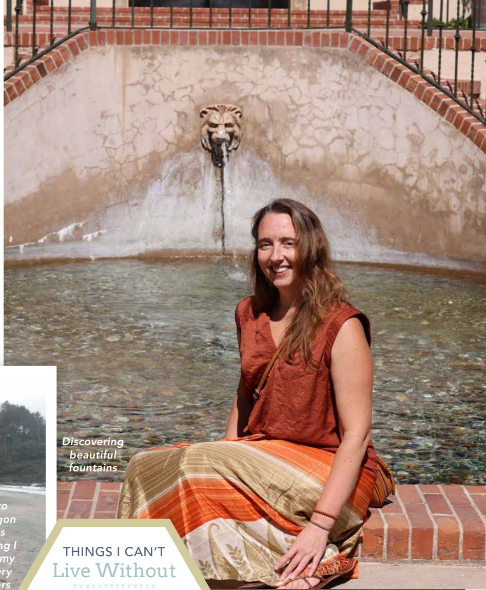
Discovering beautiful fountains

My love for travel and for cooking go hand in hand, as food is a great way to connect with people and learn about other traditions and cultures. I look forward to passing down some of my favorite recipes to my child and trying new ones together. I also love a good excuse to bake anything sweet, so I am very much looking forward to baking birthday cakes, cupcakes, and other yummy treats!