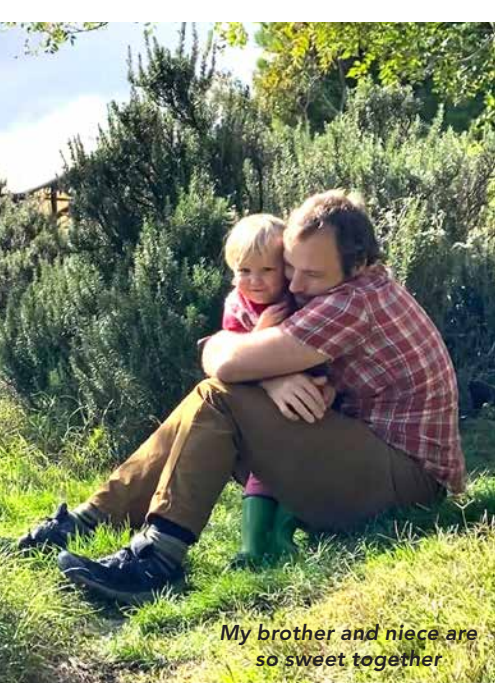
My brother and niece are so sweet together