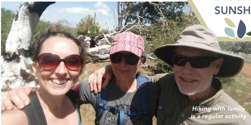
Hiking with family is a regular activity

WHEN I'M NOT WORKING, I enjoy outdoor activities, such as collecting shells at the beach, hiking in the mountains, and tending to my garden, something I can't wait to share with a kiddo.