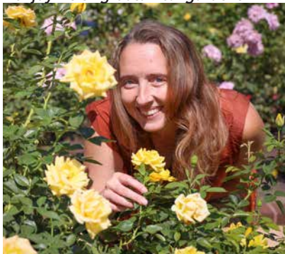
I enjoy visiting botanical gardens