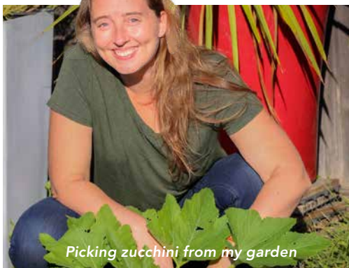
Picking zucchini from my garden