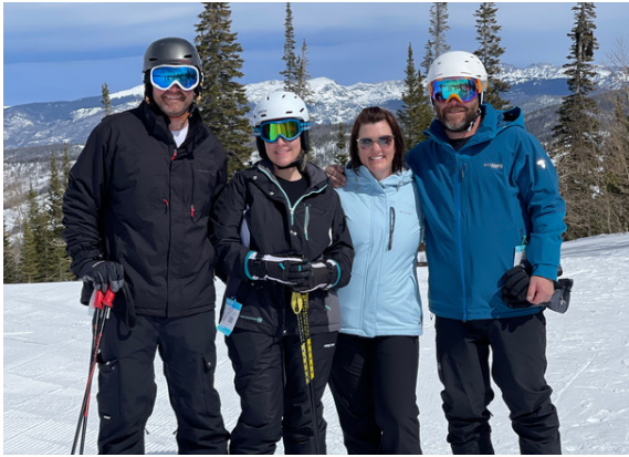
Friends from church