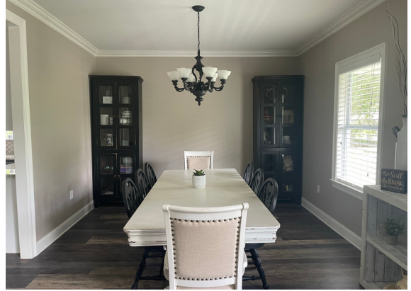
Our gathering place to eat