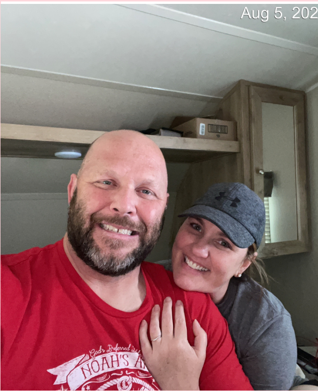
Kentucky camping trip