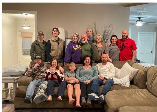
Family and friends

The whole family spends quality time together sharing in holiday traditions and having fun. Everyone is supportive of our decision to adopt and cannot wait to spoil a new addition.