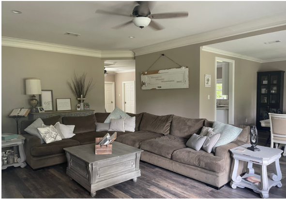
Cozy up and relax together