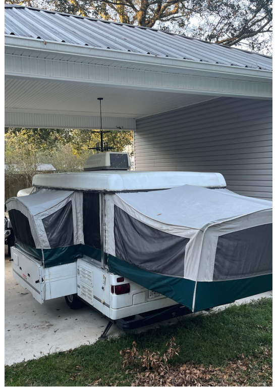
Our new (to us) pop up camper

Our life is filled with love. Our love for God, each other and our family.