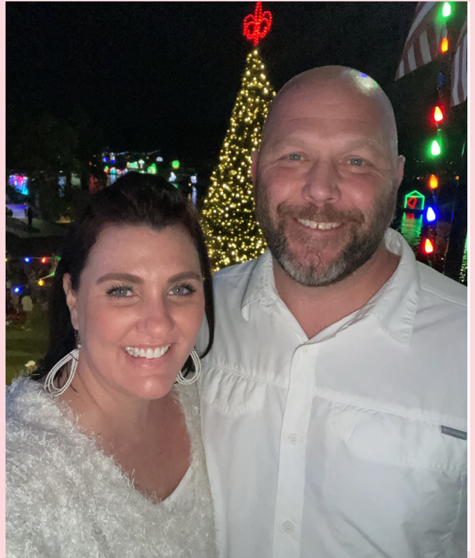
Christmas Festival In Natchitoches