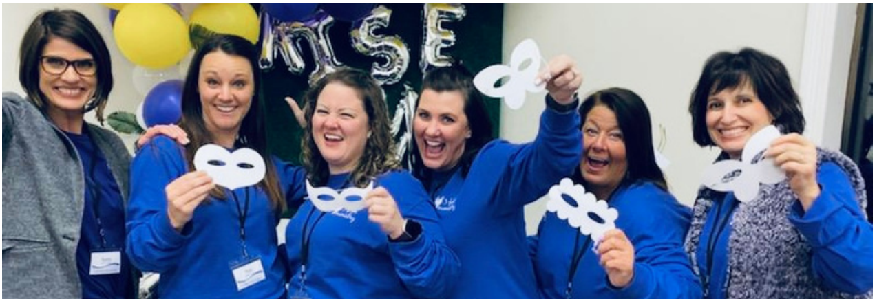
A few best girlfriends at a ladies conference