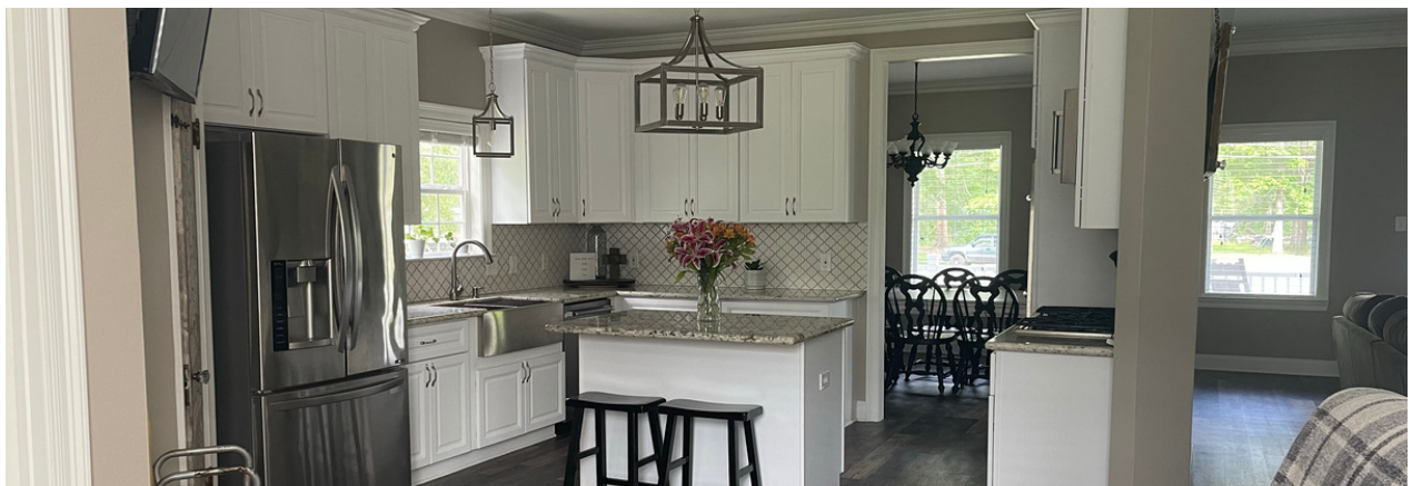
Cooking dinner together is our special time