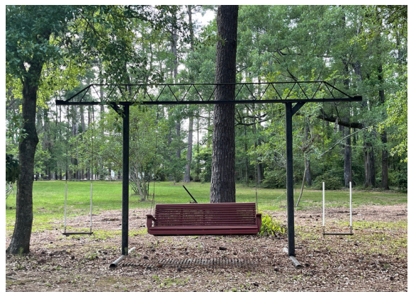
We love to swing