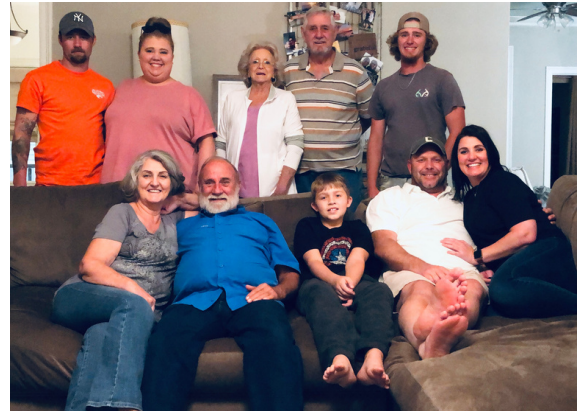
Sunday afternoon dinner