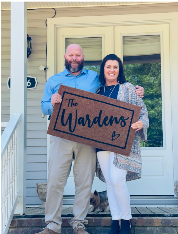
Just showing off our new door mat