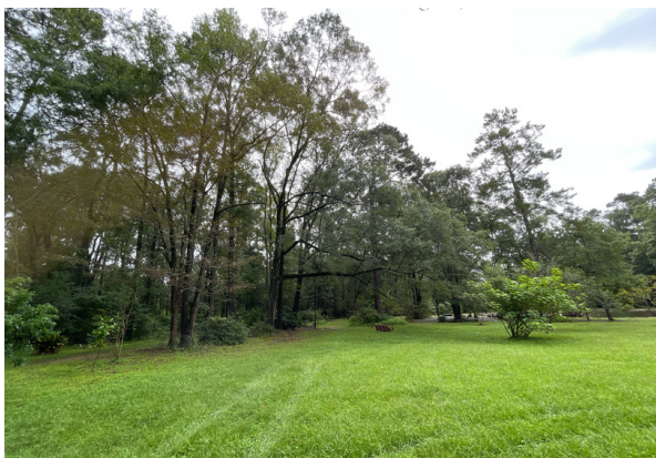
Lots of space to run and play.