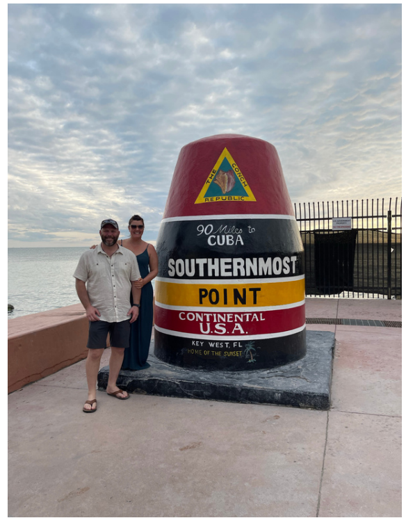
Key West Florida