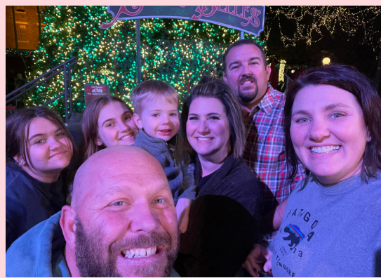
Fiesta Texas with Family