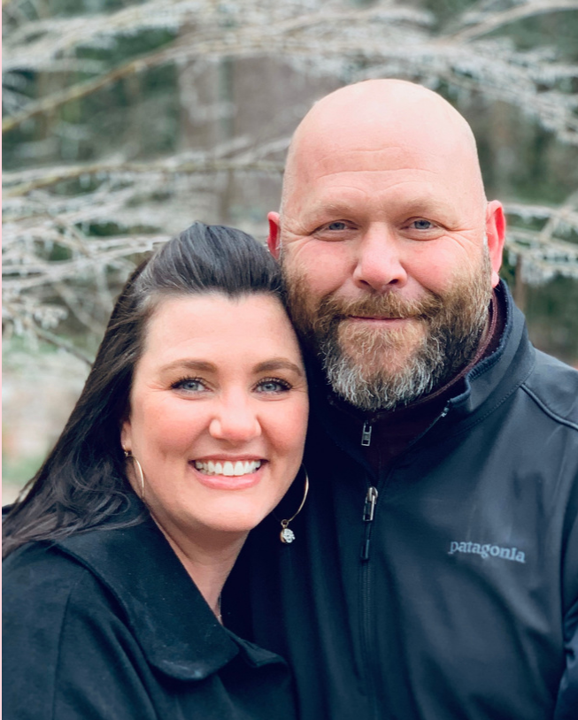
The day we said "I do"