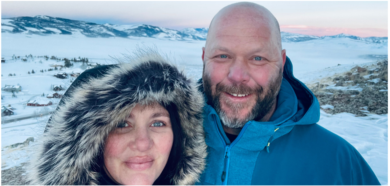
Snow Skiing in Colorado