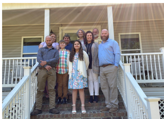
Family Easter celebration