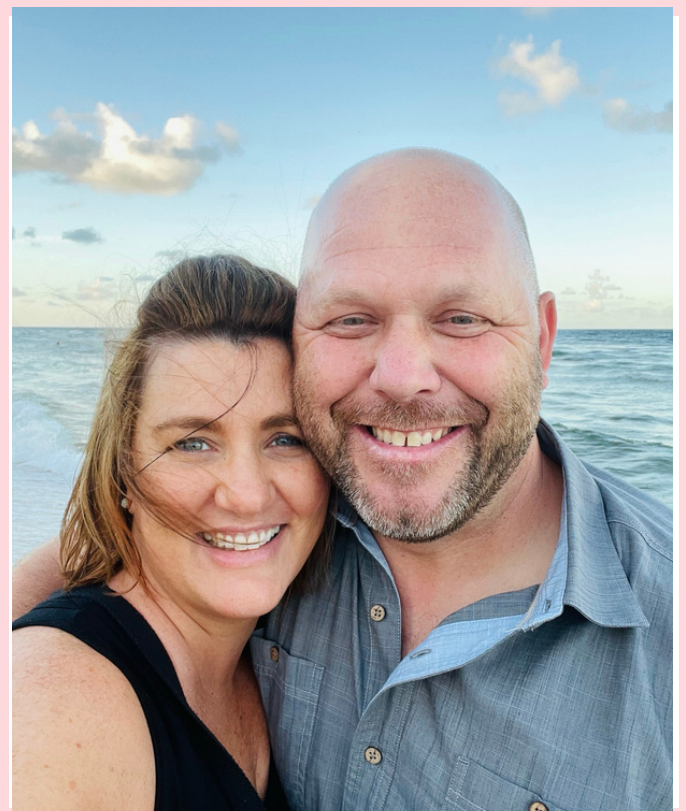
Florida beach trip