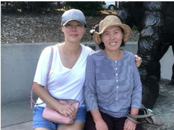
The Zoo with Mom:)