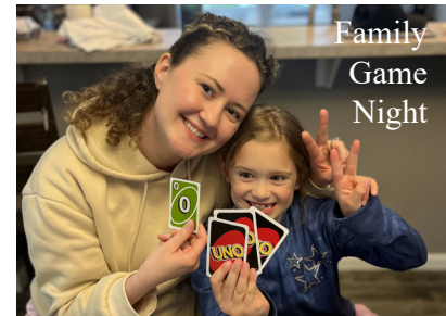
Family Game Night