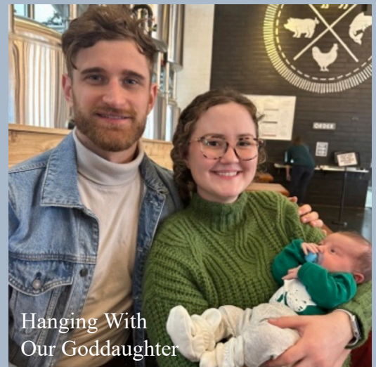
Hanging With Our Goddaughter