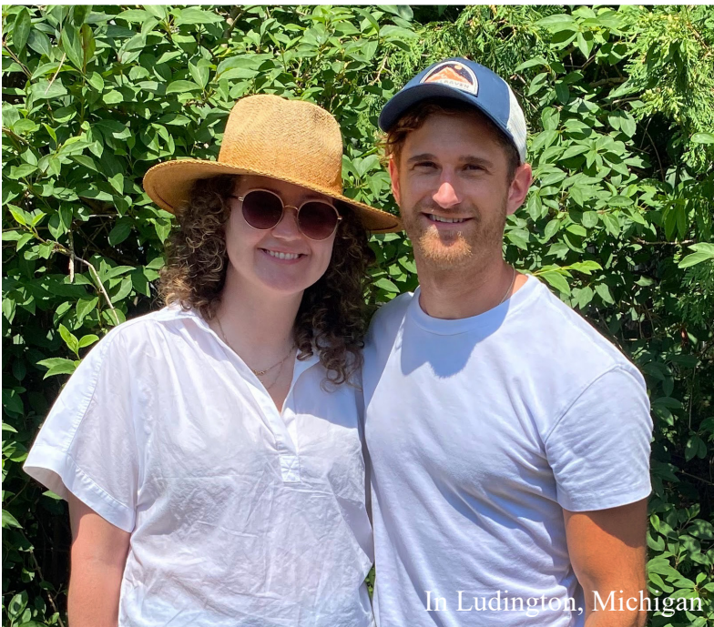
In Ludington, Michigan