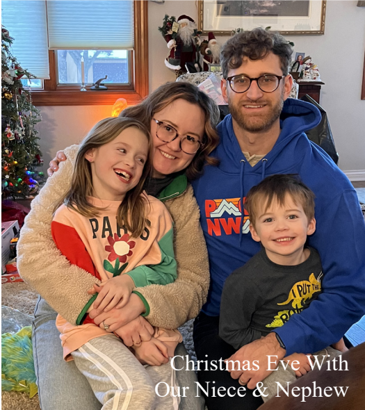
Christmas Eve With Our Niece & Nephew