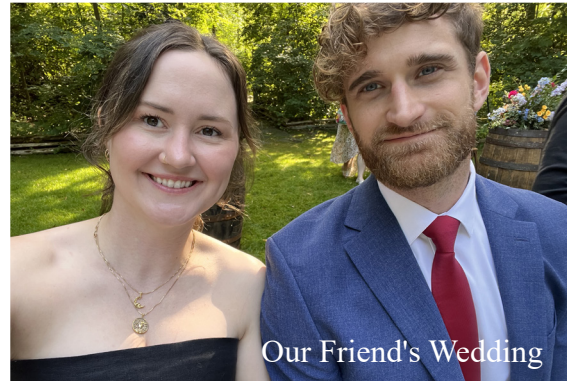
Our Friend's Wedding