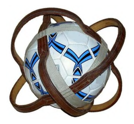
Note 1: length of the handles measured as the length of the leather without taking into account the stitching.