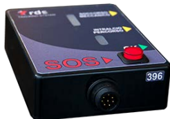
BOX GPS (owned by RDS)

The "Rally KIT" consists of a box with a SOS request button, OK button, spies monitoring supply and wiring connection to the Battery, the IGNITION and "GPS BOX" RDS.