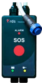
Rally KIT (purchased and installed by the crew)

The system Tracking System GPS RDS consists of two devices: