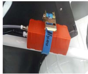
Receiver / Transmitter Unit

1) The main receiver / transmitter unit (an orange box) secured into position using the provided ratchet strap.