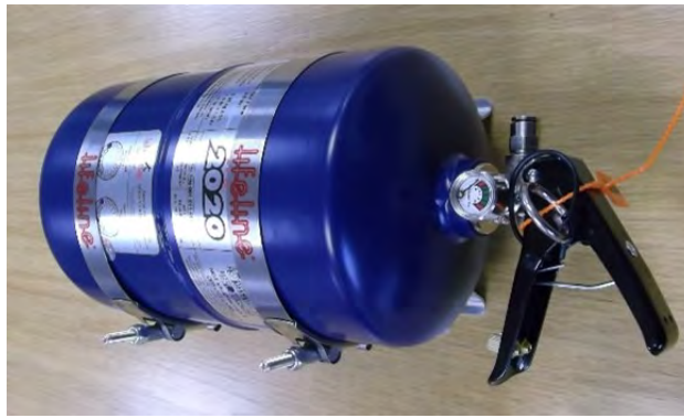
System with safety pin - not ready to be used