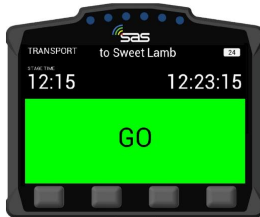
SCREEN 3. Stage Start

SCREEN 3 – Once the start time is reached, the screen will turn green as shown below and the competitor has to proceed into stage.