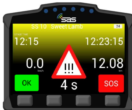
SCREEN 6. HAZARD Notification

SCREEN 6 – If a car stops during a stage for longer than 3 seconds, the unit will automatically transmit a HAZARD notification; this can either be upgraded to OK or downgraded to SOS by pressing the corresponding button to the text. A timer counts up to 60 seconds as an indication to press either the OK or SOS button.