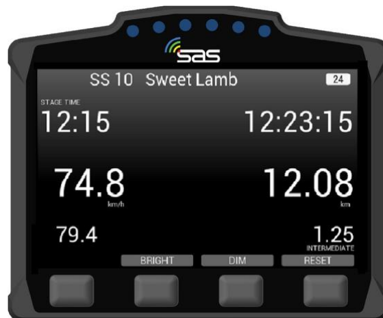
SCREEN 4. Stage mode

SCREEN 4 – Once the competitor has started the stage, the unit will automatically switch to on stage mode. The unit will start timing.