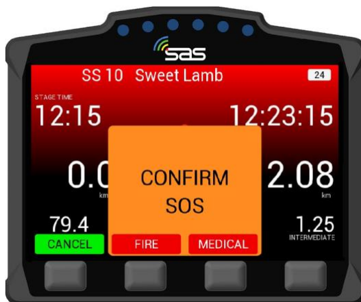
SCREEN 8. Confirm Fire SOS or Medical SOS

SCREEN 8 – If the SOS button is pressed, it must be confirmed as either a fire or medical SOS by pressing one of the two middle buttons. It can also be cancelled if pressed by mistake.