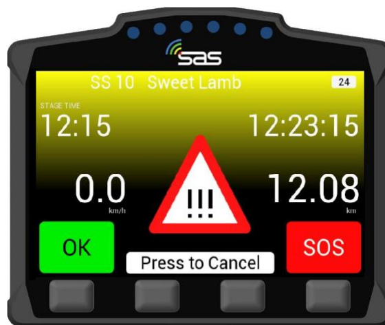
SCREEN 15. Manual Hazard in Transport Mode

SCREEN 15 – If manual hazard is sent in transport mode, this can be upgraded or downgraded the same way as a stage hazard. If the hazard is no longer required, it can also be cancelled by pressing either of the two middle buttons “PRESS TO CANCEL”.