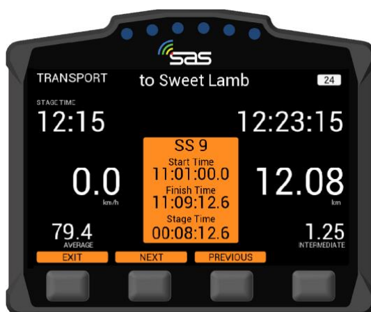
SCREEN 14. Times of completed stages

SCREEN 14 – By pressing the “VIEW TIMES” button, provisional transit and competitive stage times will display. You can select times for any of the completed stages with the next and previous buttons.