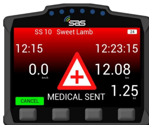
SCREEN 9. Downgrade SOS

SCREEN 9 – When the SOS is confirmed, the screen 9 will display. Even once confirmed, the hazard can be changed to OK. Pressing CANCEL and confirming the downgrade will inform race control that the crew are OK and do not need medical assistance.