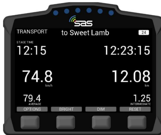
SCREEN 5. Start Time Cancelled