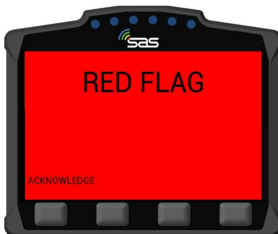
SCREEN 10. RED FLAG Acknowledge

SCREEN 10 – In the case of a serious incident, a stage may be red flagged from Race Control. The red flag will display a full screen warning until it is acknowledged. To acknowledge the flag the far left button must be pressed.