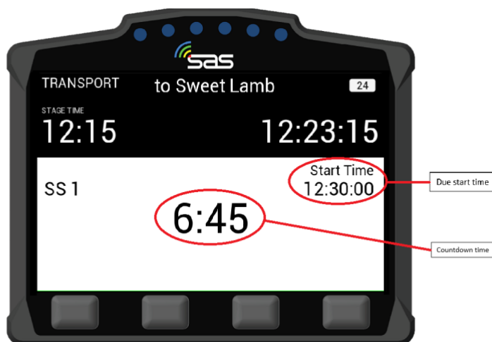
SCREEN 2. Countdown to Stage Start

SCREEN 2 – When the start official assigns each individual competitor a due start time, a countdown will display on the unit as shown in the white field below. Also shown in the white field is the stage number and the due start time.