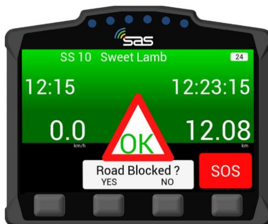
SCREEN 7. OK Acknowledgment

SCREEN 7 – If you select OK after the HAZARD alert, then the following screen will appear, showing that you and the car are OK. The Road Blocked prompt will appear below, select Yes if the vehicle is blocking the road, if the road is clear select NO.