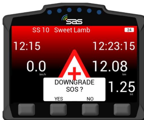
SCREEN 9A. Downgrade SOS

SCREEN 9A – If you select the cancel button on the SOS screen, you will be asked to confirm the downgrade. Once confirmed, the device will downgrade to an OK status.