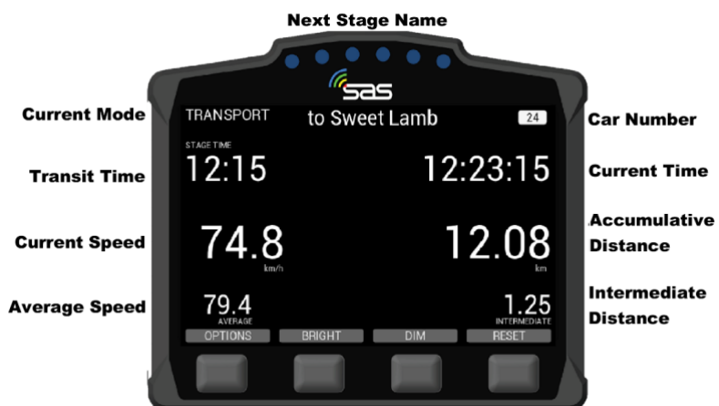
SCREEN 1. Transport Mode