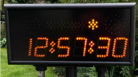
last 5s counted on the amber leds