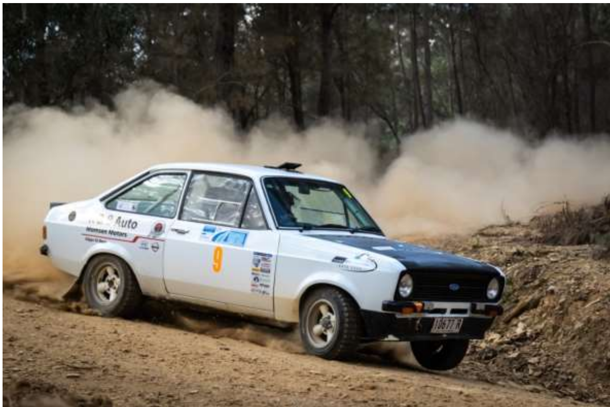
2019 Horizon Apartments Narooma Forest Rally winners – James Price and Maisie Place