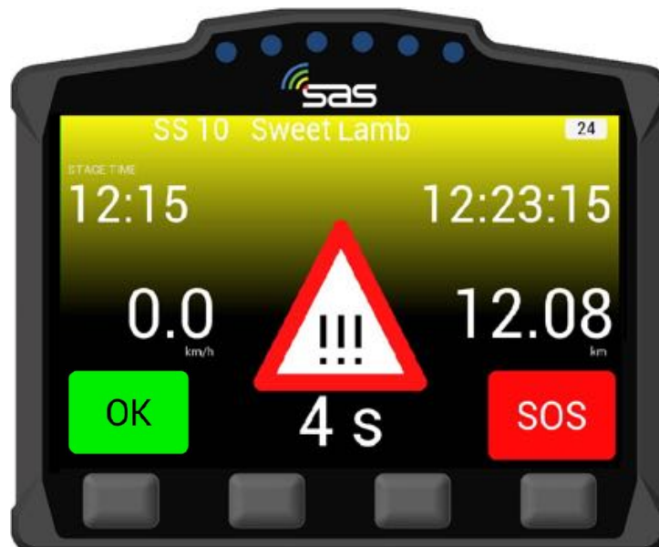
SCREEN 14: Alert ( HAZARD ) – OK or SOS muss be pressed