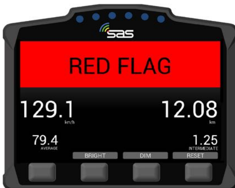
SCREEN 28: RED FLAG in a special stage mode

After the RED FLAG is displayed the regular stage mode options are displayed on the screen with a red warning [SCREEN 28].