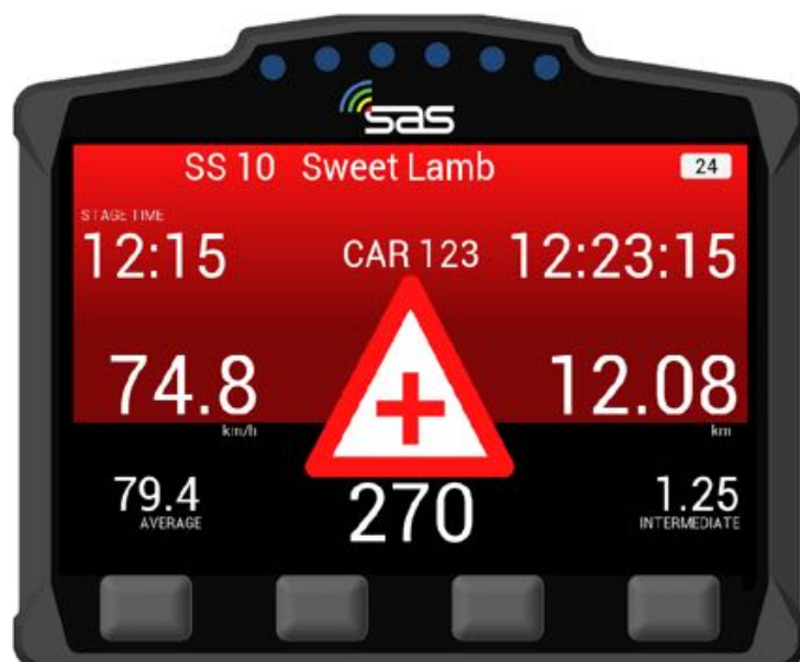
SCREEN 23: Vehicle is on / next to the road – Status SOS

If you approach to a vehicle that is in front of you and that's on or next to the route a warning triangle and the status of the vehicle are automatically displayed. In this case, the drivers involved in the accident did send a „SOS“. The crew signaled that they and the vehicle are NOT OK and need assistance. Please activate normal event emergency proceedings as per SOS situations [SCREEN 23].