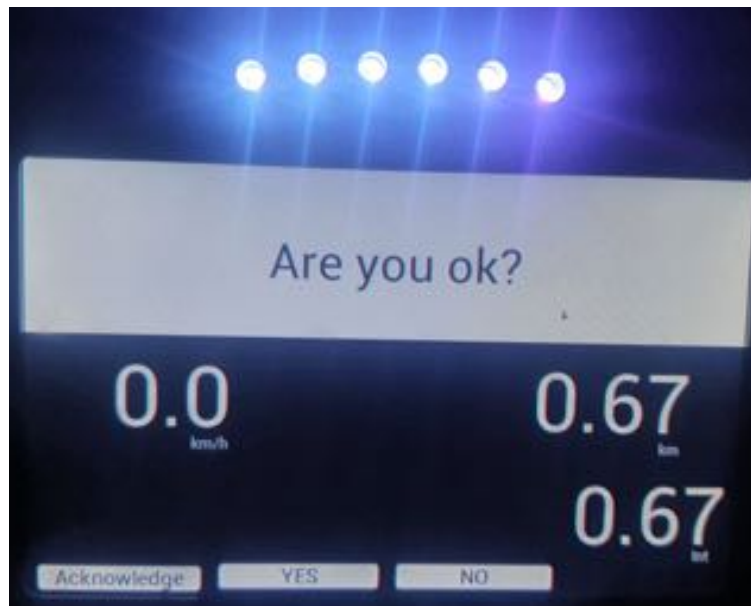
SCREEN 31: Example for a individually / manually message Question: „Are you OK?“ – answer still necessary

In addition to automatically generated messages Race-Control can also send you individually / manually generated short messages [SCREEN 31] .