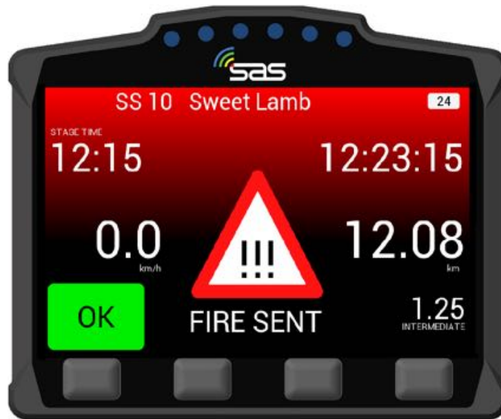
SCREEN 19: SOS confirmed, FIRE Assist required

Regardless of whether you have pressed the SOS -, FIRE - or MEDICAL -Button it is always possible to lift the emergency again. All you have to do is to press the “OK” -Button [SCREEN 18 & 19].