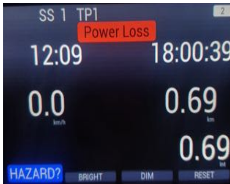
SCREEN 30: Contact RallySafe-Crew immediately!

In case of the „ Power Loss “ display [ SCREEN 30 ] the unit is operated by the internal battery. You must check as soon as possible why the unit has no external power supply and reconnect immediately! The internal battery has a short runtime.