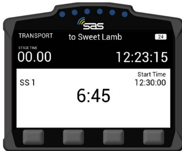
SCREEN 11: Stage Start Countdown

At your special stage start time the screen changes to „Green“, shows „Go“ and you can start the special stage [ SCREEN 12 ].