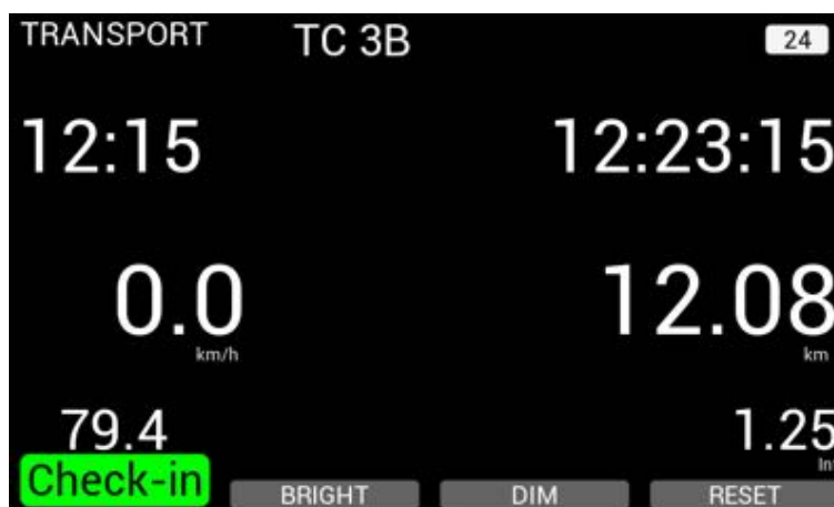
SCREEN 7: Display "Check-in" for the time control

As you approach towards a time control (TC) there'll be displayed in the lower left side of the unit "Check-in". By pressing the button below "Check-in" you start the check-in process at the respective time control.