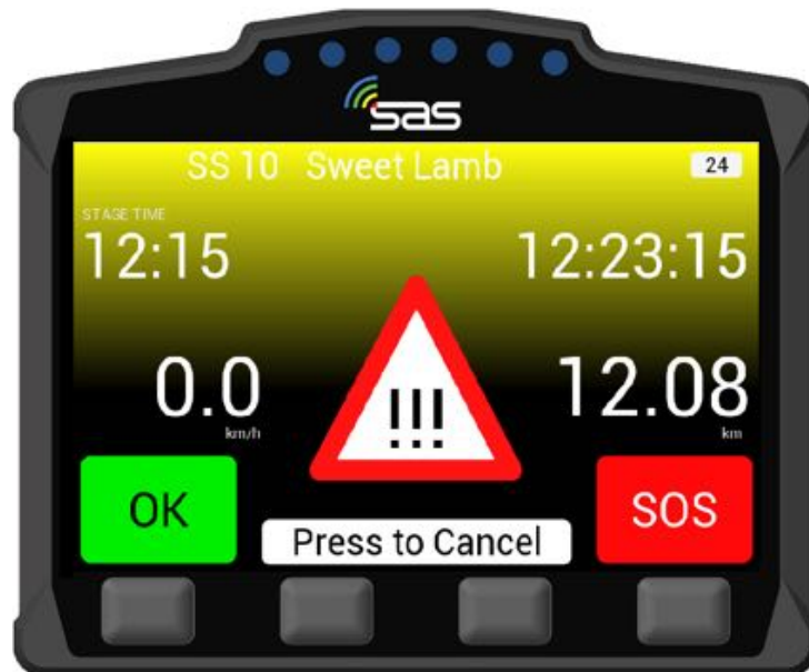
SCREEN 5: Manual Hazard

Once the hazard is no longer required, it can be cancelled by pressing either of the two middle buttons („Press to Cancel“).