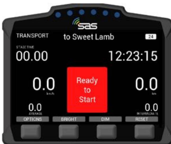
SCREEN 10: Ready to Start

Once you have passed the TC and the unit is within 20 meters of the start line the unit will then proceed to stage start mode (Ready to start) [ SCREEN 10 ].