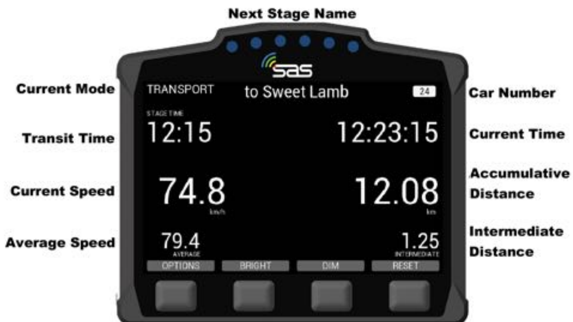
SCREEN 1: Transport-Mode