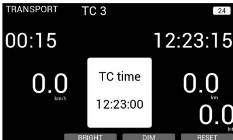
SCREEN 9: Anzeige der ZK-Zeit

In addition, it is possible that an official, e.g. at TC 0 – Start, regrouping-out or similar assigns you a time from the timing tablet [s. SCREEN 9 ].