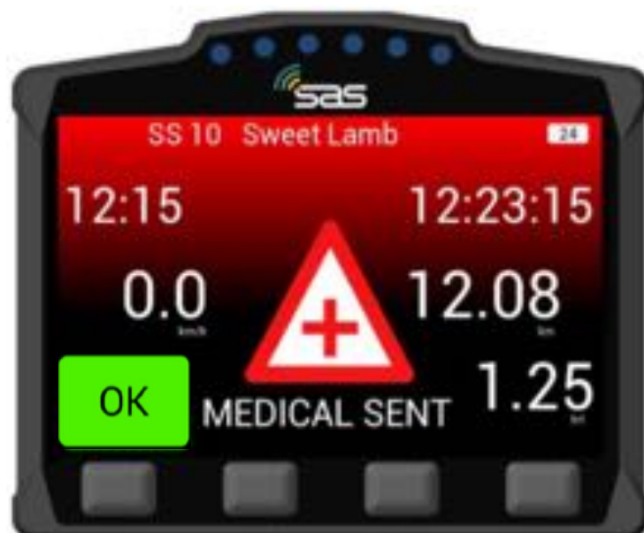
SCREEN 18: SOS confirmed, MEDICAL Assist required

If a SOS (Fire oder Medical) has been confirmed by the driver Screen 18 (Medical Sent) or Screen 19 (Fire Sent) will be displayed on your unit.