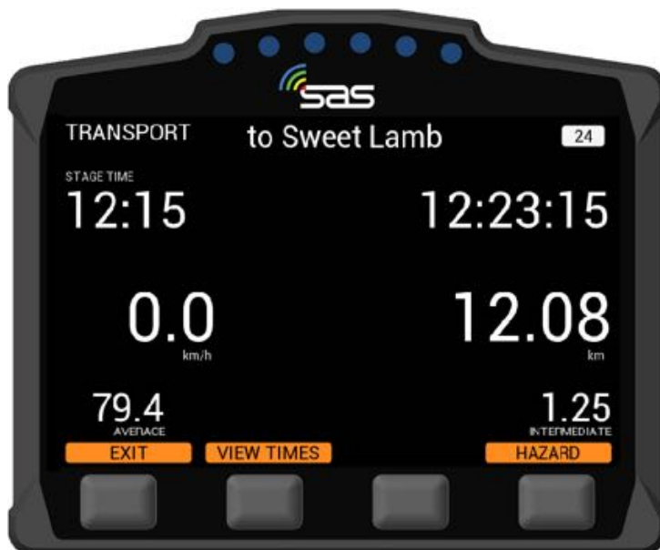
SCREEN 3: Transport-Mode – EXIT / VIEW TIMES / SEND A MANUAL HAZARD

Note: The button is not available when near a TC and may not be available at other times based on course layout.