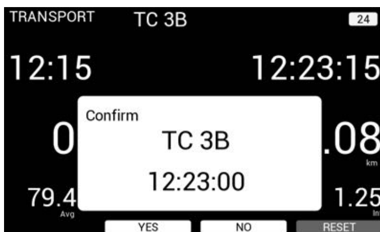
SCREEN 8: Display designated TC and check-in time – confirmation pending (Confirm)

The time will be displayed on the screen until the test minute expires or the system detects a speed.