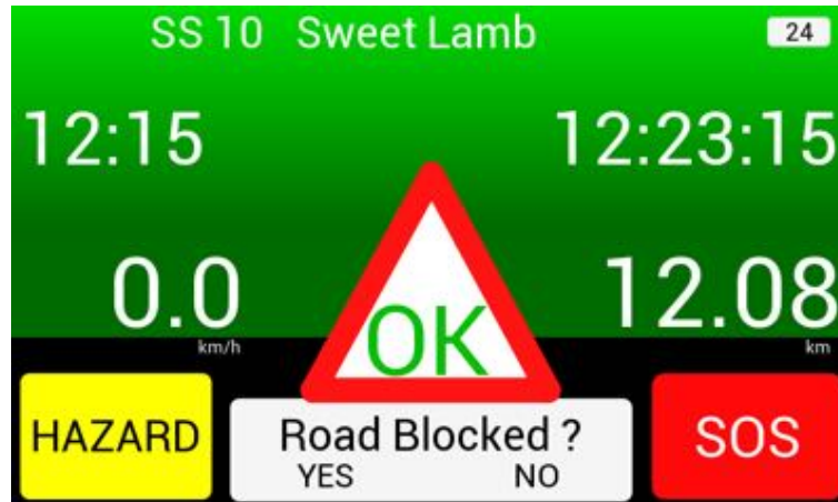
SCREEN 15: Screen „OK“– Question: „Road Blocked?“ – „YES“ or „NO“ still to push

If you select „OK“ after a Hazard alert on your screen will be displayed „OK“ [SCREEN 15]. In this case you're showing that you and your vehicle are „OK“. The „Road Blocked“ prompt will appear automatically below. Select „YES“ if the vehicle is blocking the road. If the road is clear select „NO“.