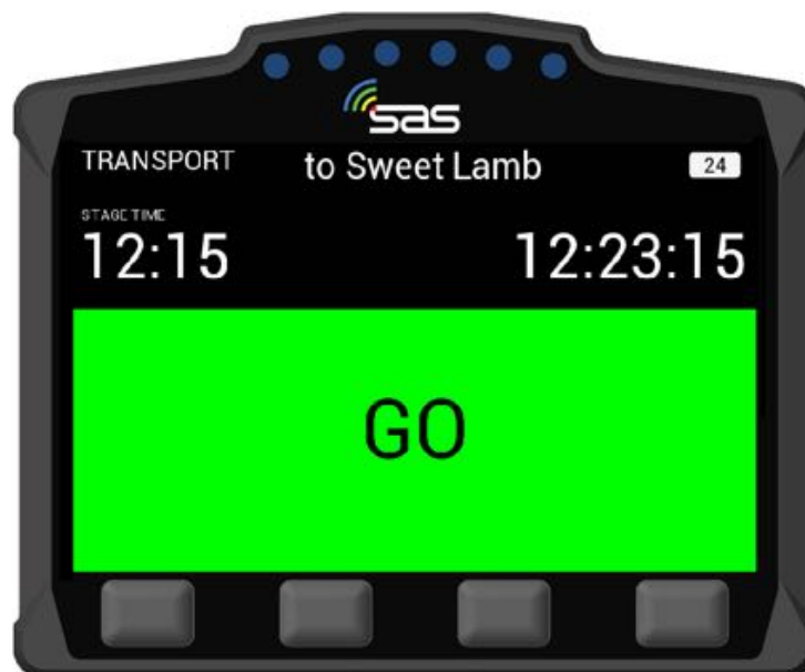
SCREEN 12: Start

At your special stage start time the screen changes to „Green“, shows „Go“ and you can start the special stage [ SCREEN 12 ].