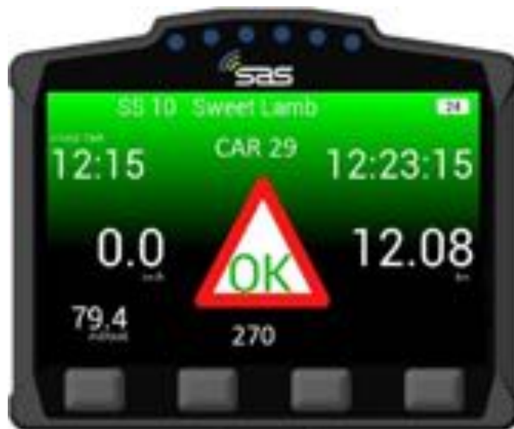
SCREEN 22: Vehicle is on / next to the road – Status OK

If you approach to a vehicle that is in front of you and that's on or next to the route a warning triangle and the status of the vehicle are automatically displayed. In this case, the drivers involved in the accident did send an „OK“. The vehicle and crew ahead are OK and in a safe place, you may proceed [SCREEN 22].