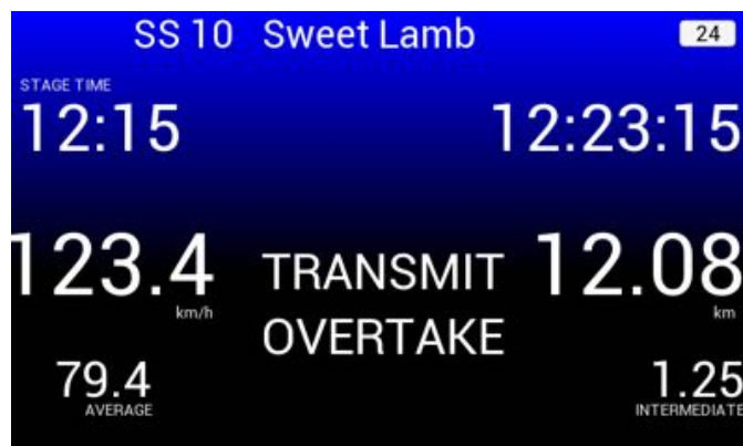
SCREEN 25: Transmitting Overtake

(NOTE: This will only function correctly when the vehicle ahead is within a preset range).