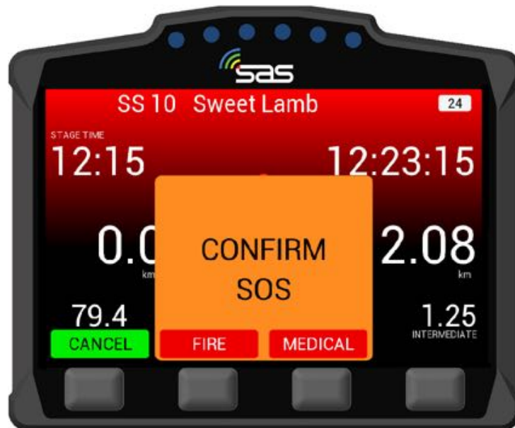
SCREEN 17: SOS confirmation (Fire or Medical)

If a SOS (Fire oder Medical) has been confirmed by the driver Screen 18 (Medical Sent) or Screen 19 (Fire Sent) will be displayed on your unit.