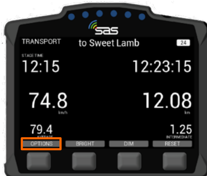
SCREEN 2: Options in Transport-Mode

The unit has four black buttons. In different screens those buttons can do different things, so their functions are listed on the screen above the button's location.