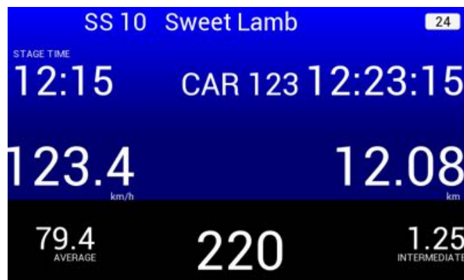
SCREEN 26: Receiving Overtake

In this case car 123 wants to overtake and is about 220 meters behind.