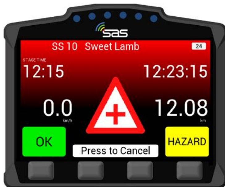
SCREEN 6: Manual SOS