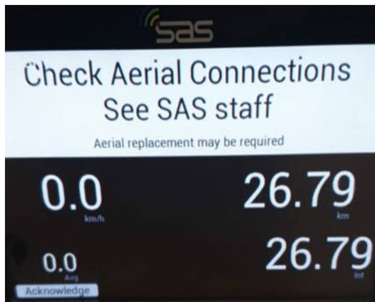
SCREEN 29: Contact RallySafe-Crew immediately!

If messages according to SCREEN 29 and SCREEN 30 appear, please contact immediately! the RallySafe-Crew: