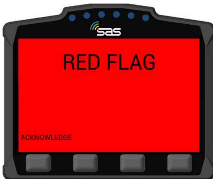
SCREEN 27: RED FLAG & Acknowledgement)

If RED FLAG is displayed you must adapt your driving style and reduce speed in accordance the the DMSB Rally Regulations and / or the Supplementary Regulations.