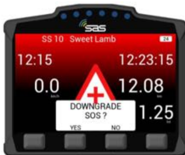
SCREEN 20: Question: “Downgrade SOS? – answer still necessary

After selecting „OK“ you've to confirm again [SCREEN 20].