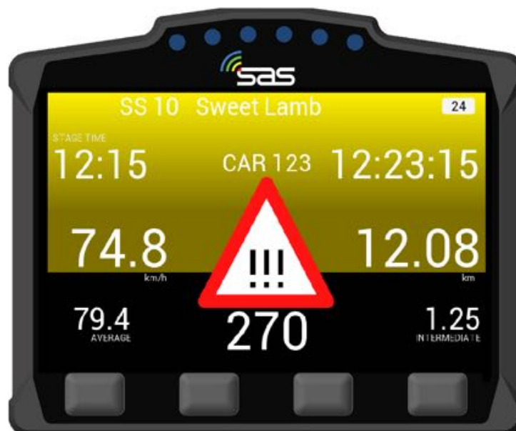
SCREEN 21: Hazard – Vehicle is on / next to the road – Status not confirmed [HAZARD]

The vehicle may be blocking the road. Proceed with caution as you may come across a fully or partially blocked road [SCREEN 21].