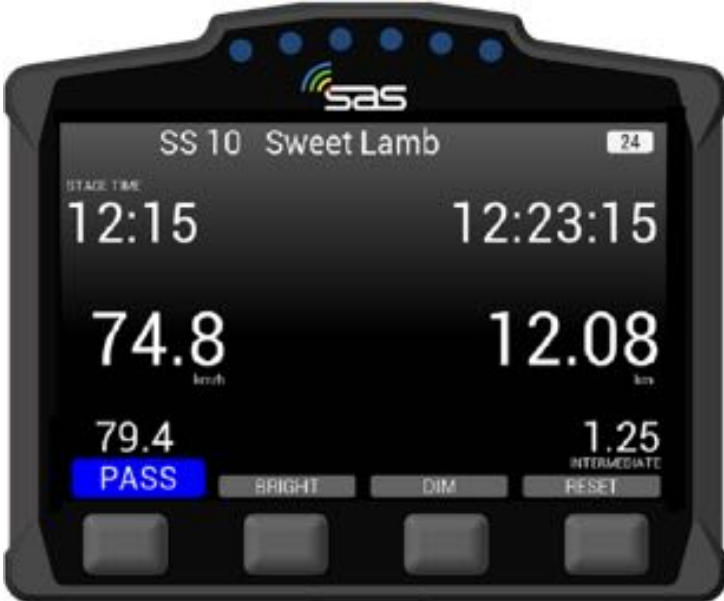
SCREEN 13: Stage-Mode