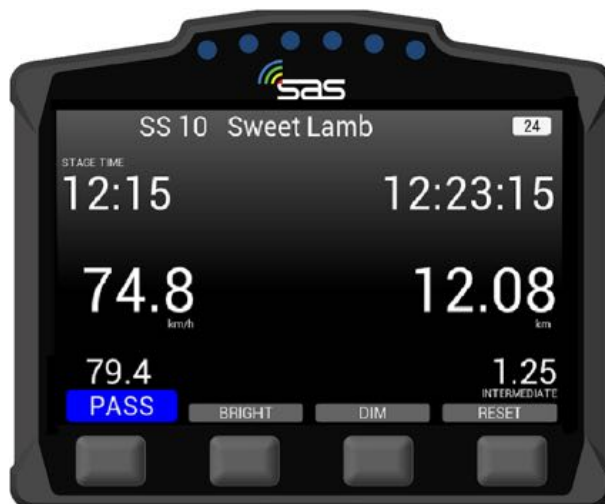
SCREEN 24: Push to pass – send overtake

To activate this function you have to press the button under the “PASS” section [SCREEN 24].