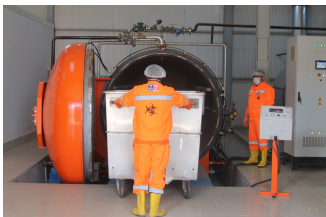
(ZoomPak operational staff preparing the waste for autoclaving)

The treatment center has sufficient treatment capacity (1.5 tons per cycle) to safely treat the entire biohazardous waste in the Greater Accra Region. However, the facility did not receive enough waste to meet this operational capacity - the system was heavily underutilized and was only operated a few hours per week serving less than ten health facilities.