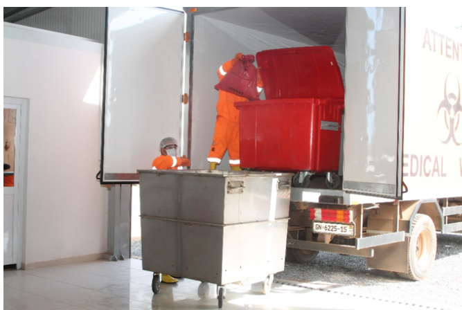
ZoomPak staff transferring medical waste collected from various health facilities into containers at the treatment facility

The partnership with UNDP/GEF project will continue to contribute to increase the subscriber base of ZoomPak's services and hopes to consolidate in other regions where treatment technologies have been installed.