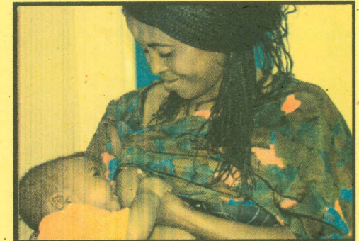
0 -6 months Exclusive Breast Feeding