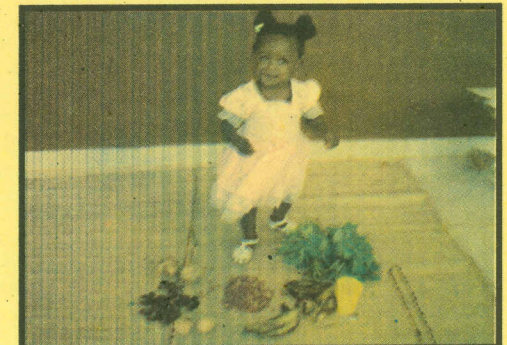
25-59 Months Family Foods Rich in Micronutrients