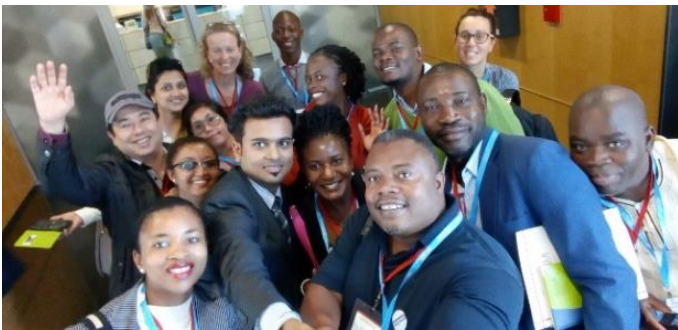
Trainees at Global Fund Headquarters in Geneva

“Feeling quite empowered, the manufacturing facilities and the quality control and assurance laboratory tour at USP have expanded my scope of understanding as a pharmaceutical professional. It is my wish that everyone in the industry should acquire this knowledge for the betterment of Public Health.”