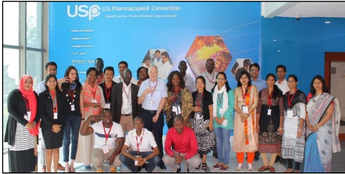
Trainees at United States Pharmacopeia Facility