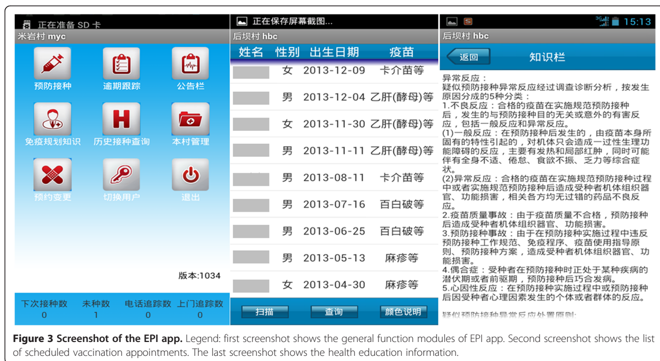
Figure 3 Screenshot of the EPI app. Legend: first screenshot shows the general function modules of EPI app. Second screenshot shows the list of scheduled vaccination appointments. The last screenshot shows the health education information.

intradermal and subcutaneous injections and send this to village doctors through this app. In this way, village doctors will learn knowledge about immunization at any time or any place.