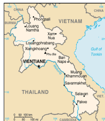
Figure 2. Lao PDR, the NIP office is located in the capital of Vientiane.

The public health system for Laos is a standard,