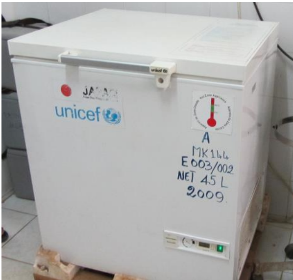
Figure 3 Vaccine refrigerator labeled with 'A' for reporting.

to be used in the message syntax. Currently, health workers are reporting Pneumococcal vaccine (with a P), and Pentavalent vaccine (with a D). Other codes have been set aside to allow reporting of all routine vaccines. Figure 6 shows several variations of similar monthly report messages that are all valid. Spontaneous reports are for events that need immediate action such as a refrigerator needing repair or a vaccine stock out. The administration tasks are more advanced features but are provided for completeness and include keywords for help pages, changing response language, and registering a new phone number.