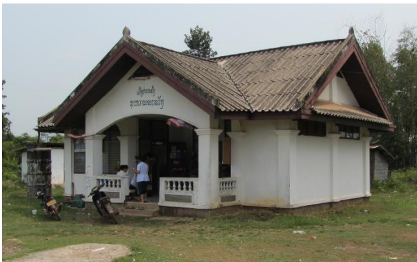
Figure 1 Typical rural health center staffed by approximately four health workers

low, and the provinces behave much like districts in larger countries. Immunization services follow this hierarchy, with vaccines stored at the national store, provincial stores, and district stores. A substantial amount of the system management takes place at the provincial level. For example equipment repair is an activity managed by a provincial staff. In rural areas, the primary health facility is a health center which provides basic services (including immunization) and has a staff of about four.